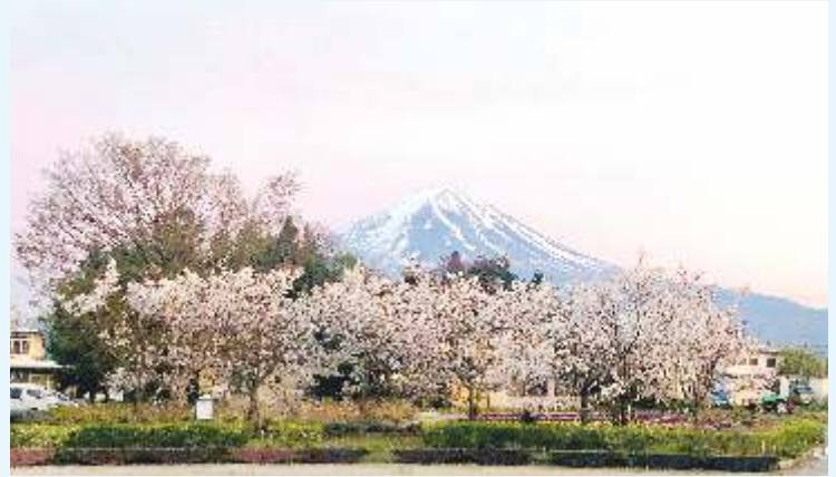
Majestic Mount Fuji