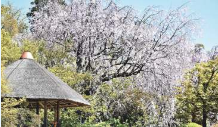
When spring blossoms

We are sharing with you a few photos depicting sakura, chosen from among the entries to THE CLICK! JAPAN PHOTO CONTEST 2019 held last year. (Please see November 2019 issue of Japan Calling.)