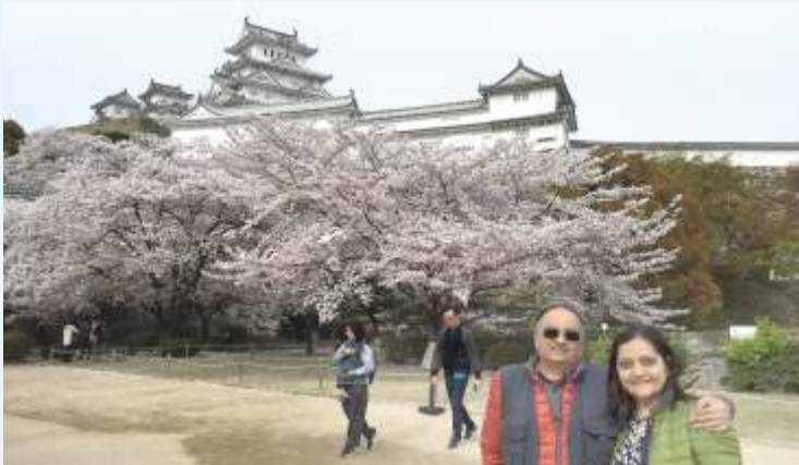
Beautiful colours of Sakura at Himeji Castle