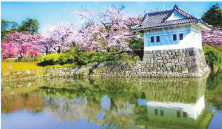
A breath-taking reflection