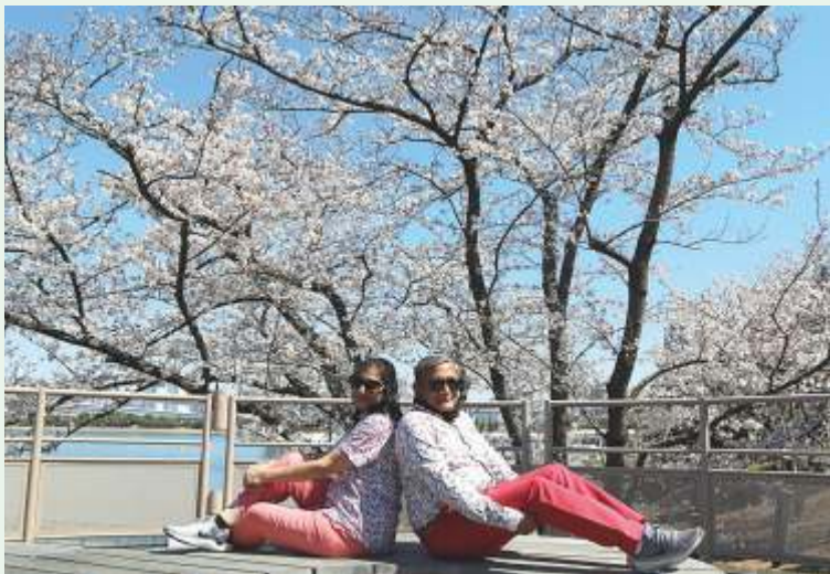
Osaka Night - Sakura