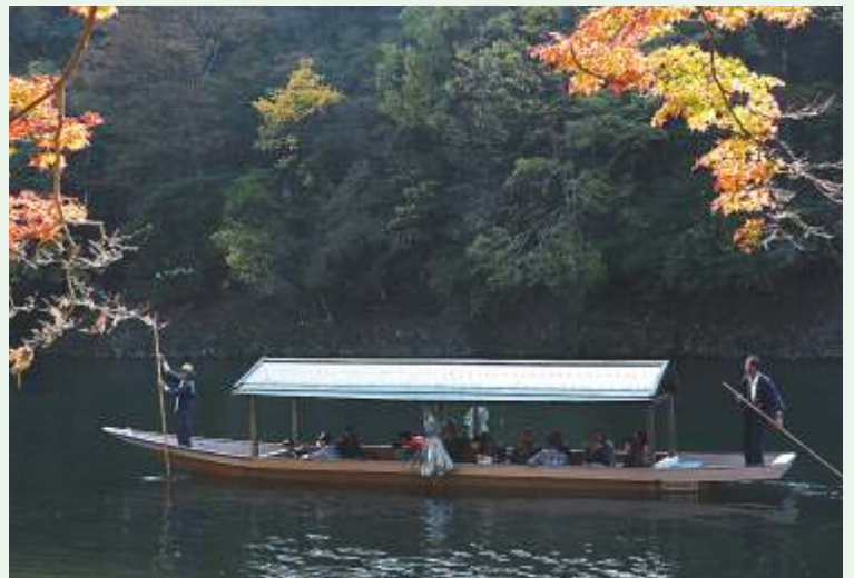
Autumn Festival Marvel

Imsurenla Longkumer (Among Top 10 Winners)