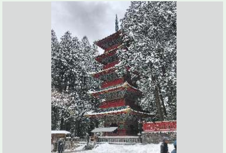
The five storied Pagoda

Aishwariya Rathod (Among Top 10 Winners)