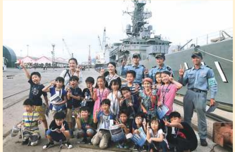
On 11th September, Children from Japanese School Educational Trust of Chennai visited Japan Maritime Self-Defense Force's Vessel, Asagiri , at Port of Chennai.