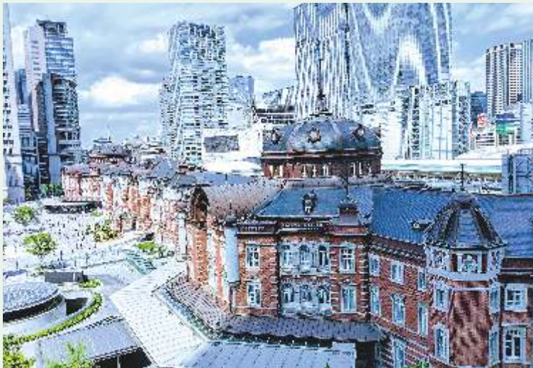
Aozora: Where tradition blends with modernity