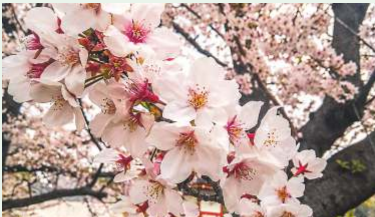
Stunning Colours of Nature in Sakura