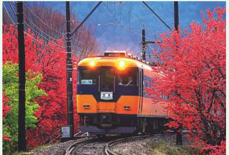
Layer and Flavour of Japan