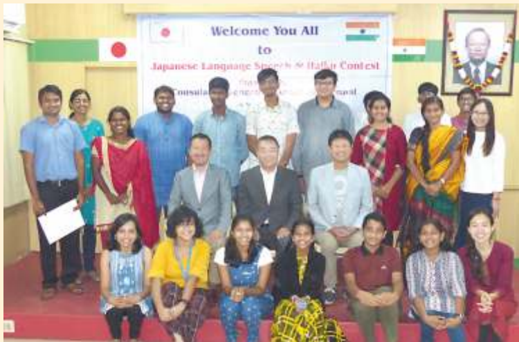
On 29th September, Consulate-General of Japan in Chennai organized a Japanese Language Speech and Haiku Contest at ABK-AOTS Dosokai Tamilnadu Center.