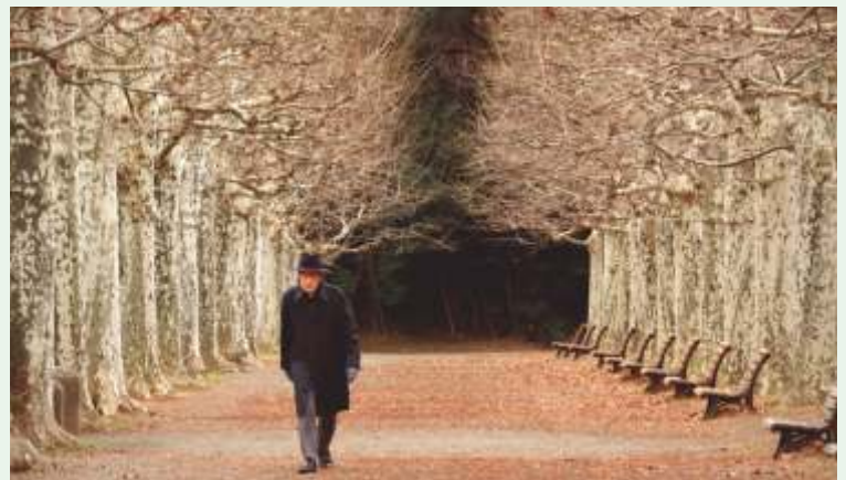
Walk with Dignity