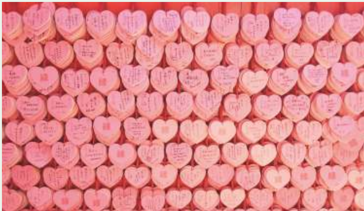
Bond of Love