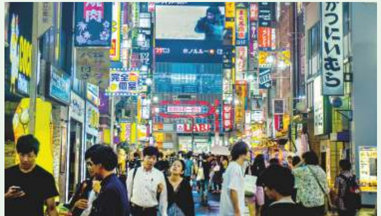
Tokyo's Neon City - Shinjuku