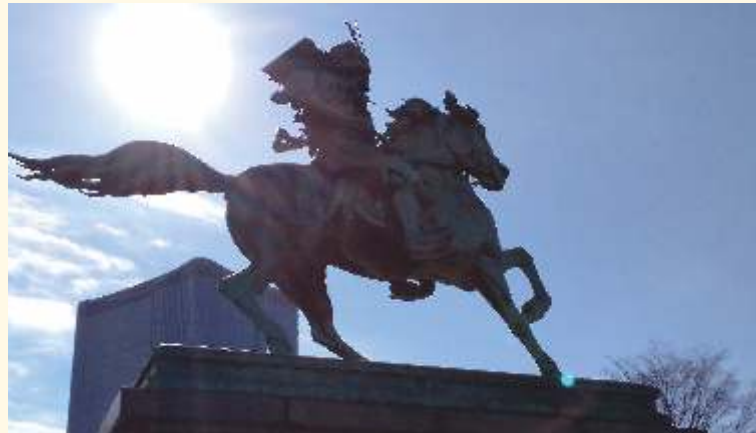
Statue of Kusunoki Masashige in Tokyo