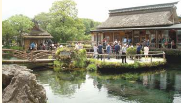
Picnickers at Fujikawaguchiko, Yamanashi Prefecture