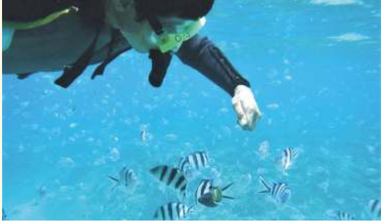
The underwater treasure I found in Japan

Shown here are some beautiful photographs based on the theme of summer, received as entries for THE CLICK! JAPAN PHOTO CONTEST 2018 held last year. (Please see October 2018 issue of 'Japan Calling'.) We look forward to your entry to THE CLICK! JAPAN PHOTO CONTEST 2019, which will be announced soon!