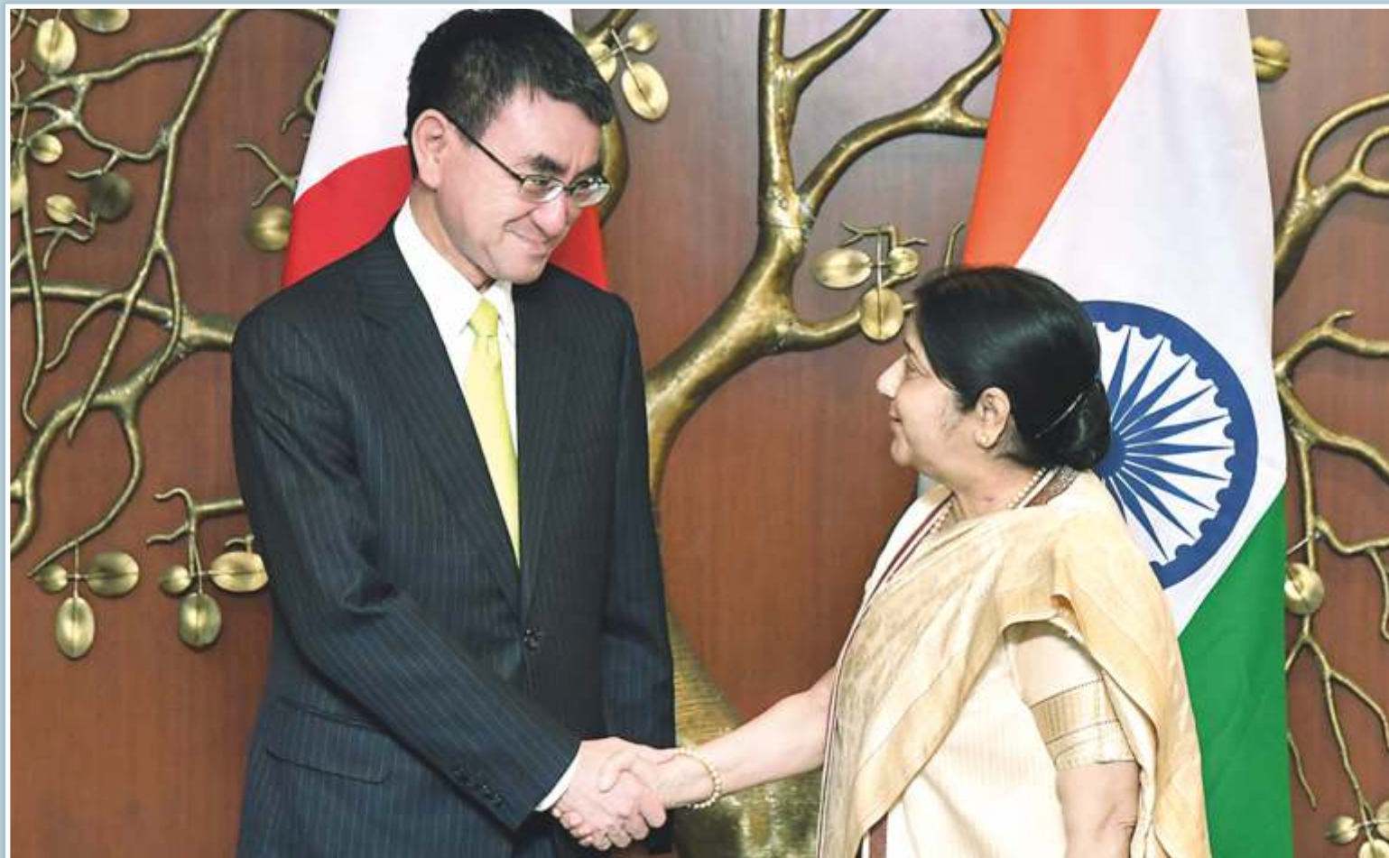
Mr. Taro Kono, Minister for Foreign Affairs of Japan, held the 10th Japan-India Foreign Ministers' Strategic Dialogue with H.E. Ms. Sushma Swaraj, Minister of External Affairs of India, during his visit to India, on 7th January.