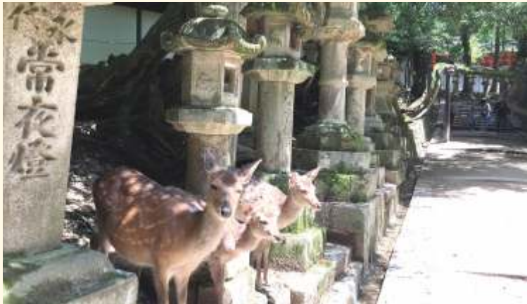
A deer family enjoying the sun in Nara Deer Park