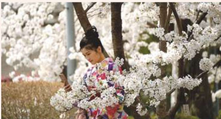
Sakura covered selfie