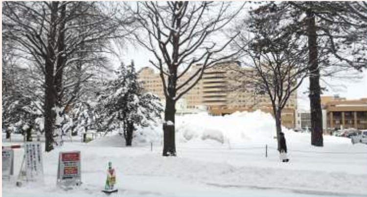
A sunny, snowing morning

From snow and slopes to blossoms and blooms, Japan is stunning all year round. Shown here are some beautiful photographs based on the theme of winter and spring, received as entries for THE CLICK! JAPAN PHOTO CONTEST 2018 held earlier this year. (Please see October 2018 issue of 'Japan Calling'.)