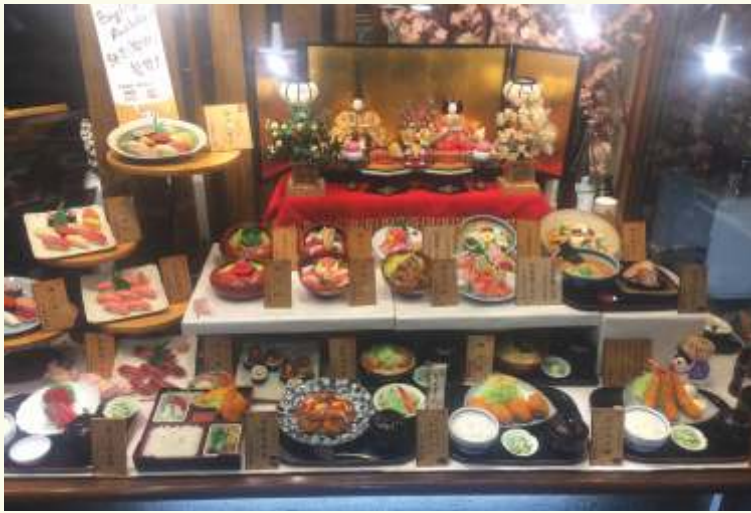
The "oishii" means "tasty" food of Japan