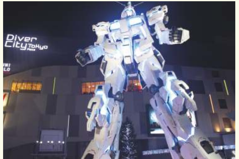
Do it Gundam style