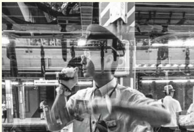
The Humble Station Master