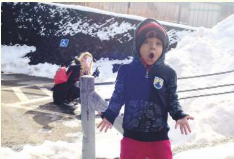
Amazed @ Mount Fuji !!