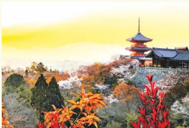
The sunset that tells story of 1000 years

Shown here are some of the exceptional photos captured by the contestants, presenting their best memories of Japan, which were designated as the top 10 entries.