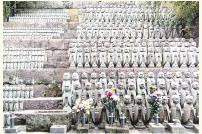
Small Buddhist Jizo (Bodhisattva) Statues