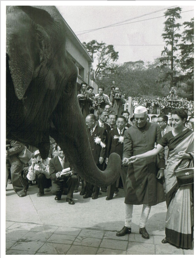
Photo Exhibition on the journey of Japan-India relations since the Meiji era