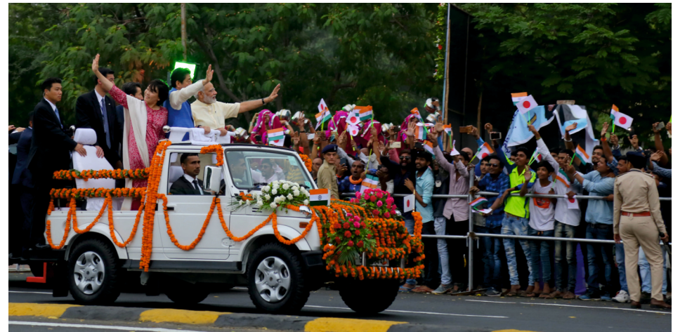
Photo Exhibition on the journey of Japan-India relations since the Meiji era

Foyer outside C.D. Deshmukh Auditorium & Quadrangle Garden India International Centre, (Gate No.2) 40 Lodi Estate, New Delhi 110003