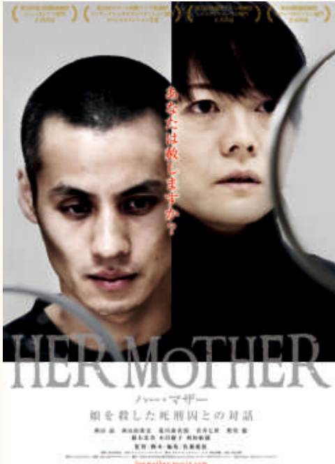
© 2016 HER MOTHER Film Partners

Co-presented by Dharamshala International Film Festival