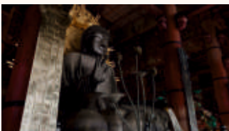
Todaiji-temple, The world of the great Buddha