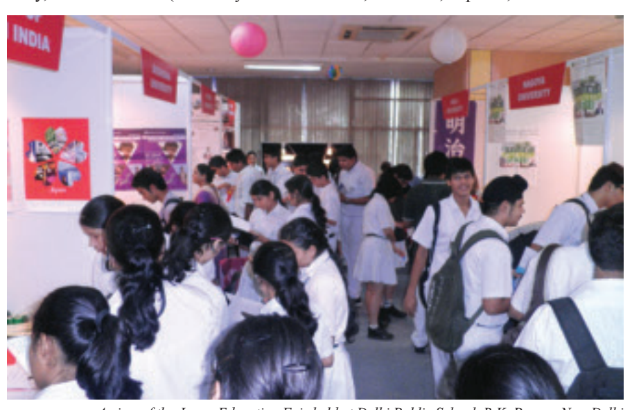
A view of the Japan Education Fair held at Delhi Public School, R.K. Puram, New Delhi

Japan Education Fair, which was funded by the MEXT (Ministry of Education, Culture, Sports, Science and