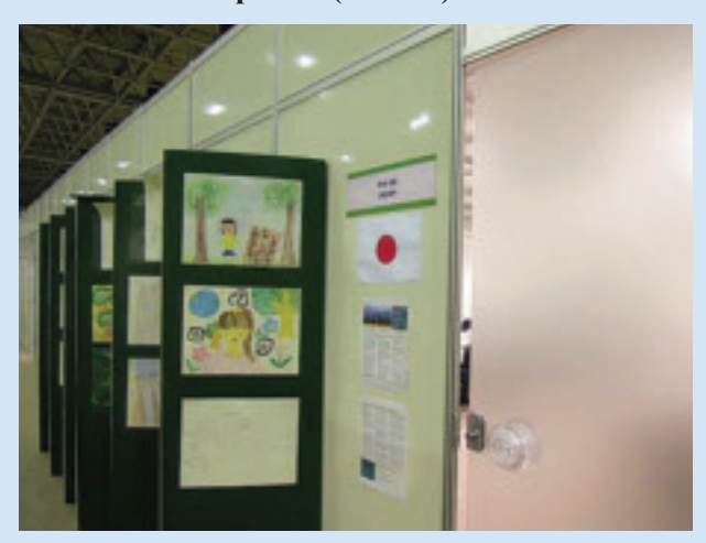
Display of children's paintings at the Side Event