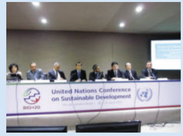
Side event - Panel Discussion