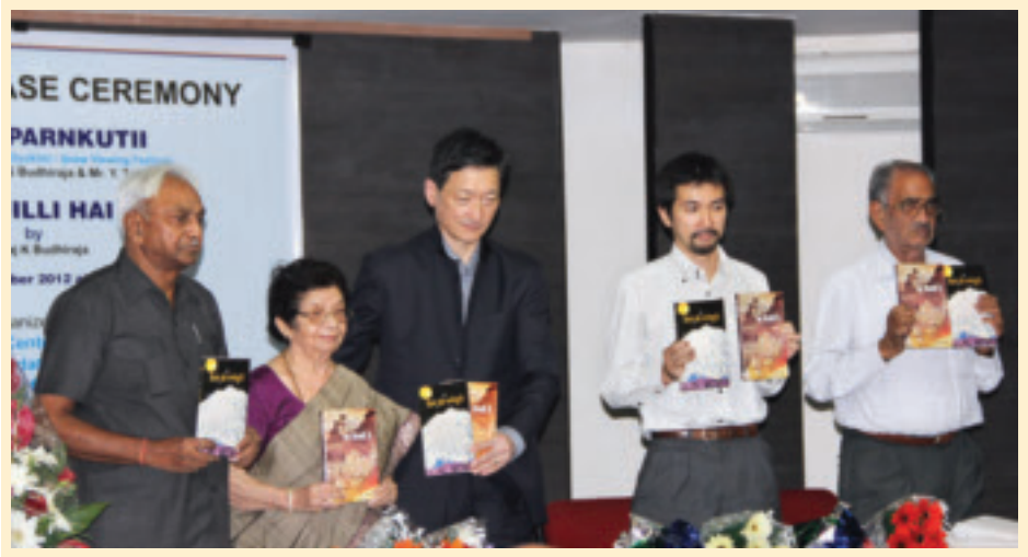
Book Release Ceremony in progress

n the occasion of the 60<sup>th</sup> anniversary of diplomatic relations between Japan and India being celebrated this year, a Book Release Ceremony took place on 7<sup>th</sup> September 2012, at the Rabindranath Tagore Hall of The Japan Foundation, New Delhi. The following books were released at the event, which was jointly organized by the Indian Council for Japanese