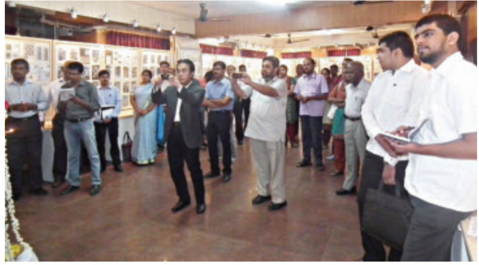
A section of philatelists and enthusiasts who attended the function

and distinctly different from those of other countries of the world. He mentioned that starting fifty years after India issued its first stamp 'Scinde Dak' in 1852, Japan Post came with its first 'Dragon Stamp', and how it surpassed by rolling out nearly two hundred stamps every year, whereas India's figure is somewhere between 50 to 70. In the last decade (2002-2011), Japan issued 1682 stamps while India issued around 700 stamps. In effect, Japan releases one stamp every alternate day. On World Heritage Sites alone, Japan is-