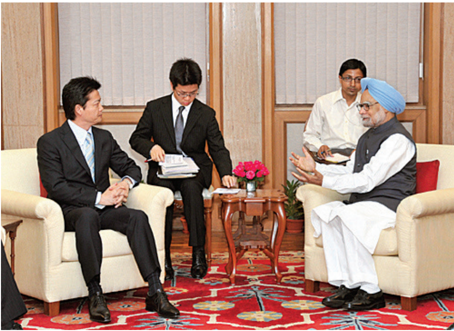
Courtesy Call on His Excellency Dr. Manmohan Singh, Prime Minister of India