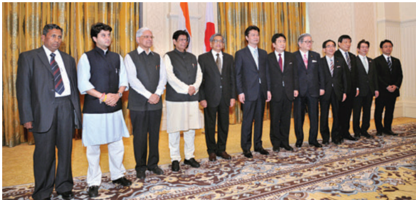
The First India-Japan Ministerial-Level Economic Dialogue