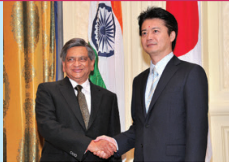
Mr. Koichiro Gemba, Minister for Foreign Affairs of Japan (right), with H.E. Mr. S.M. Krishna, Minister of External Affairs of India, at the Sixth Japan-India Foreign Ministers' Strategic Dialogue held in New Delhi on 30 April 2012

2012 – Celebrating 60 th Anniversary of the Establishment of Diplomatic Relations between Japan and India ‘Resurgent Japan and Vibrant India: New Discoveries, New Exchanges’