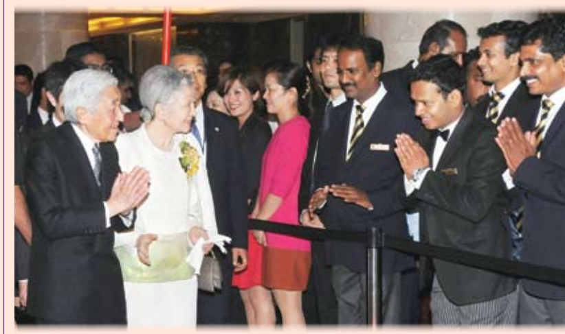
Their Majesties depart India after Their historic visit