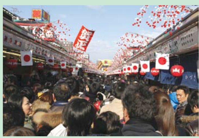
New Year's visit to Senso-ji Temple

To see more pictures or find information about travelling in Japan, visit the Japan National Tourism Organization (JNTO) website http://www.jnto.go.jp/