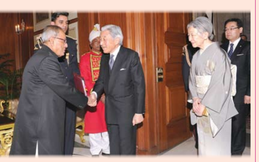
President Pranab Mukherjee with Their Majesties at Rashtrapati Bhavan