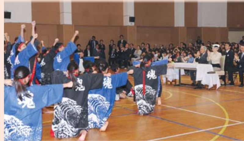
Emperor Akihito and Empress Michiko watch the students' performance during Their visit at the Japanese School, New Delhi