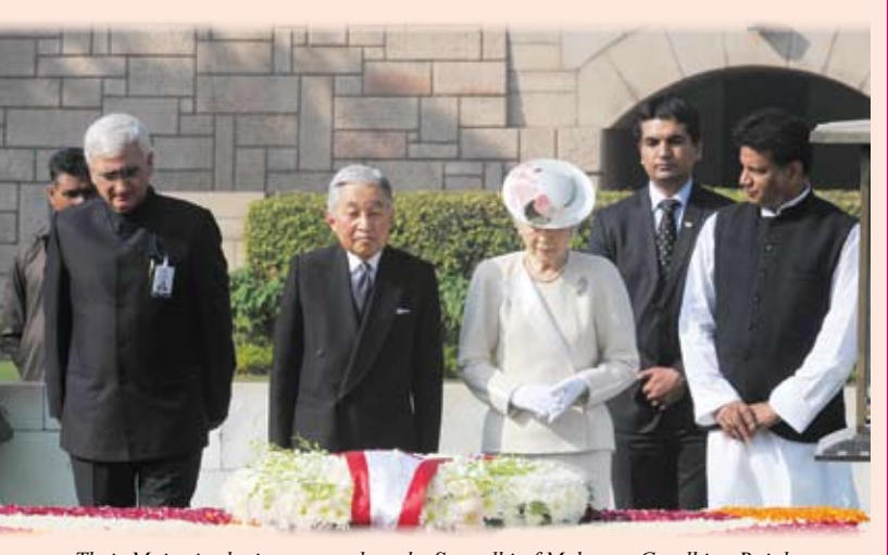
Their Majesties laying a wreath at the Samadhi of Mahatma Gandhi at Rajghat