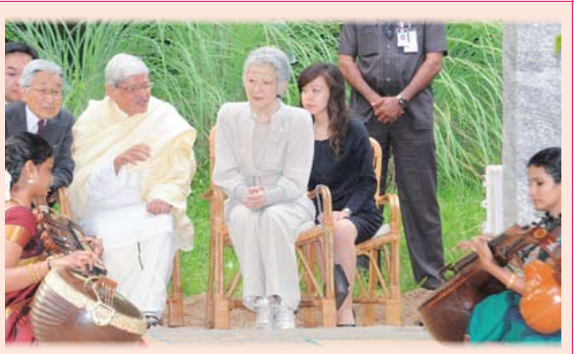
The Emperor and Empress at the Demonstration of Veena at the Kalakshetra Foundation in Chennai