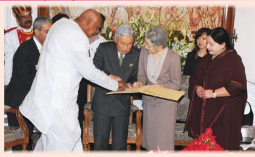
Governor of Tamil Nadu, Dr. K. Rosaiah, releasing a commemorative postage stamp to mark the visit of Emperor and Empress of Japan to India, in Chennai. Chief Minister Dr. J. Jayalalithaa is also seen in the picture