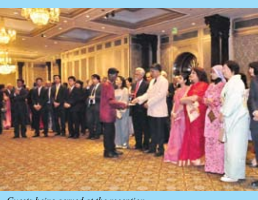
{\it Guests \ being \ served \ at \ the \ reception}