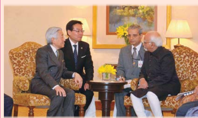
Emperor Akihito meeting with Vice President M. Hamid Ansari