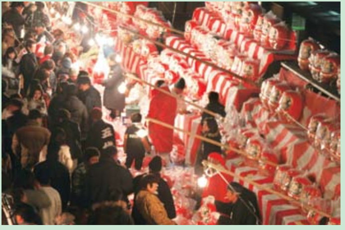
Maebashi Hatsuichi Festival