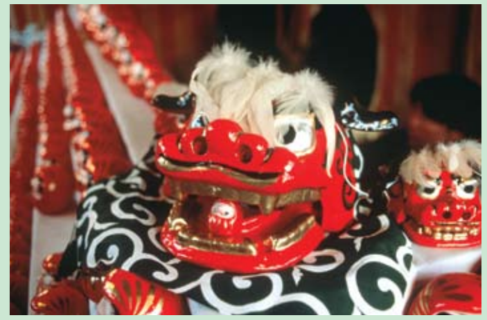
Shishimai (Lion Dance)