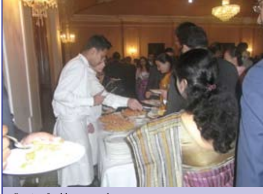
Serving freshly prepared tempura