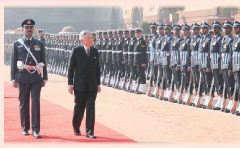
Emperor Akihito inspecting the Guard of Honour at the Ceremonial Reception at Rashtrapati Bhavan