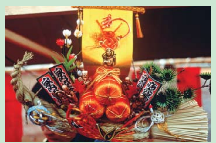
Shime-Kazari (Straw Rope Decorations)