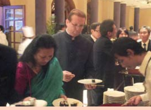
Guests tasting Japanese food