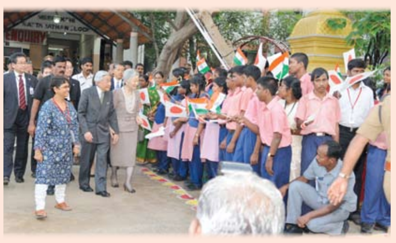
Emperor and Empress of Japan visiting the Spastic Society of Tamil Nadu in Chennai (Photo courtesy: Ministry of External Affairs of India – P D Photo by N. Varadharajan)

(Photo courtesy: Ministry of External Affairs of India – P D Photo by N. Varadharajan)