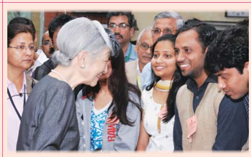
Her Majesty Empress Michiko interacting with students of Jawaharlal Nehru University, in New Delhi