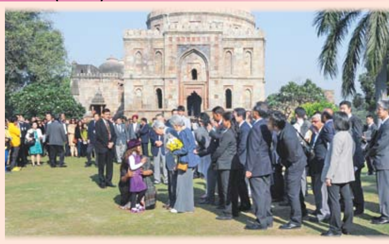
Their Majesties received a bouquet by Indian children at Lodhi Garden, New Delhi