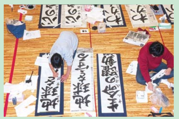
Kakizome (First writing of New Year)