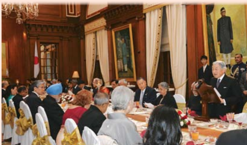
His Majesty Emperor Akihito making an address at the Welcome Banquet hosted by President Pranab Mukherjee