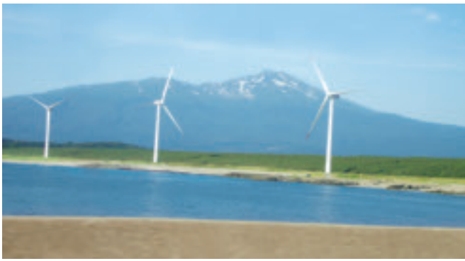
Windmills in Yamagata

wastes were recycled. They said that recycling is not something remote to them, but is an everyday part of their life. They have also started campaigning to reduce trash, which they believe to be the most important factor in the recycling process. After that, we visited the beautiful five-storey Pagoda which was around a century old, but still very amazing.