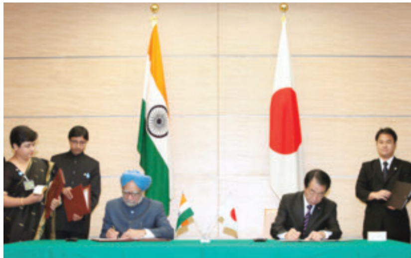
Photograph of the leaders signing a joint statement and other documents

Following their Annual Summit Meeting on October 25, 2010, the two Prime Ministers issued a Joint Statement, whose salient features are given below: