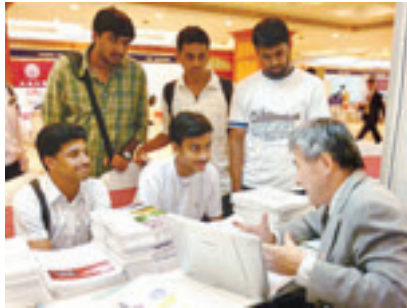
Japan Education Seminar 2009 in India

In order to attract more international students to Japan, The Ministry of Education, Culture, Sports, Science and Technology of Japan (MEXT) launched the “Global 30” Project for Establishing Core Universities for Internationalization and selected 13 universities to function as core institutions to receive and educate students from abroad. Under the Project, a student can obtain a degree from a prestigious Japanese university by taking programs taught in English, both in undergraduate and graduate levels.