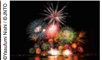
Hiroshima Yume-Minato Fireworks Display