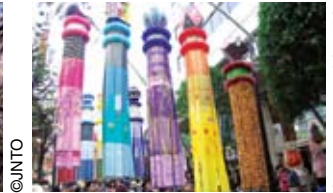
Sendai Tanabata Festival