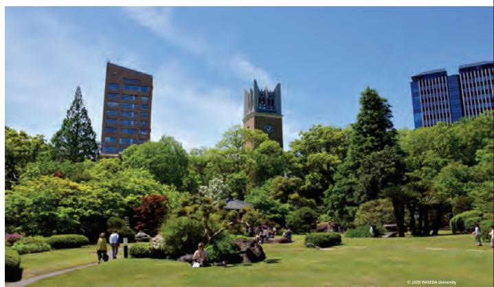
(Campus of Waseda University)

Most importantly, Japan is known as a safe country to live in, with its low crime rate.