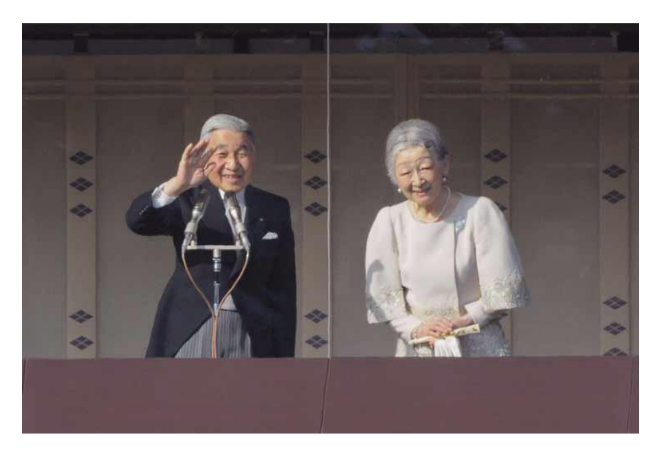
The Imperial Family are greeted by the public during the New Year celebrations. (January 2012)

As stated in the Constitution of Japan, the Emperor is "the symbol of the State and of the unity of the people" and derives His position from "the will of the people with whom resides sovereign power".