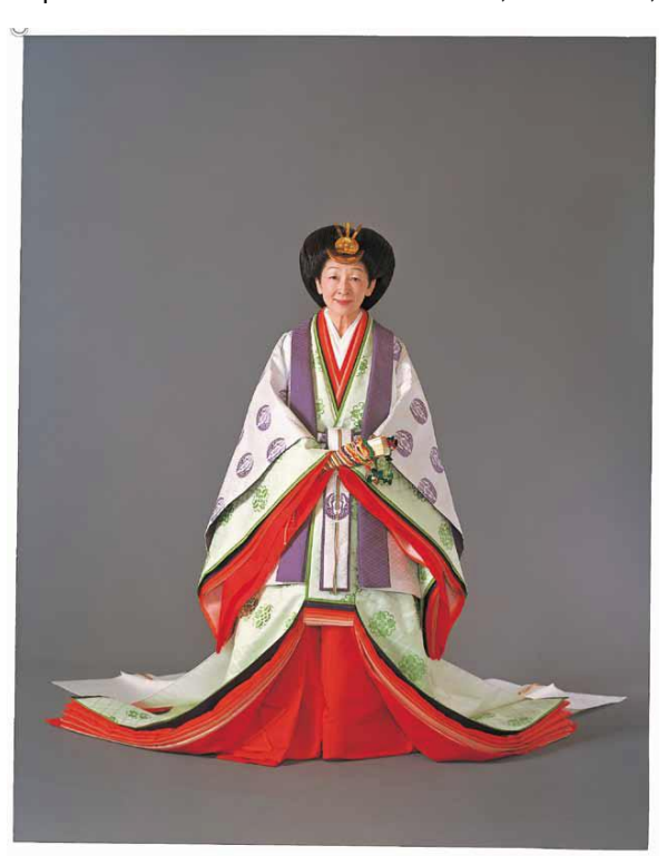
Empress Michiko wears the traditional twelve-layered robe, the Junihitoe , at the Ceremony of the Enthronement. (November 1990)