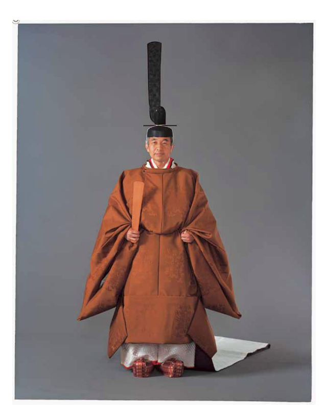
Emperor Akihito wears the traditional robe, the Sokutai, at the Ceremony of the Enthronement. (November 1990)