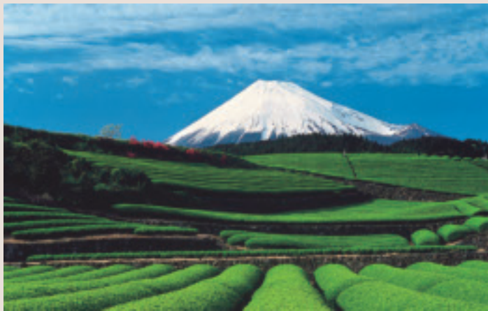
Mt. Fuji in spring