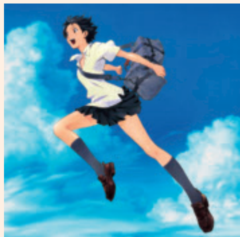
The Girl Who Leapt Through Time