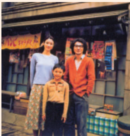
Always – Sunset on Third Street

The Embassy of Japan in collaboration with National Intergrated Forum of Artists and Activists (NIFAA) will also be holding Japanese Film Festival at Karnal. Akira Kurosawa's classic 'Rashomon' and animation film 'Tombstone of Fireflies' (Dir: Isao Takahata) will be screened.