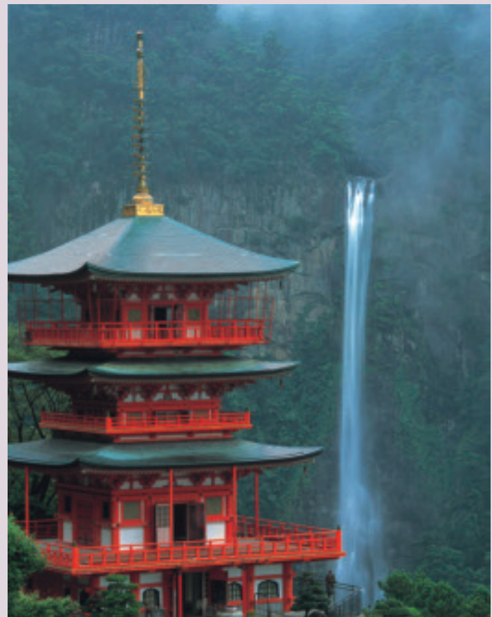
Seigantoji Temple & Nachi waterfalls