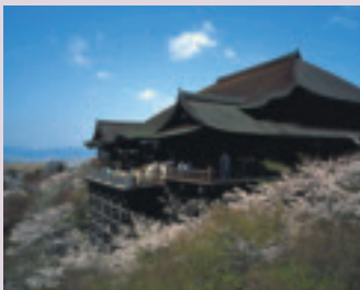
Kiyomizudera in spring

UNESCO adopted “The World Heritage Convention” in 1972 which aims to preserve cultural and natural legacies with conspicuous and universal value for future generations. In 1993, the Shirakami-Sanchi Mountain Range, Yakushima Island, Himeji-jo Castle, and the Buddhist monuments of the Horyu-ji Temple Areas were registered as Japan’s first World Heritage sites. In the years since, Genbaku Dome in Hiroshima, Itsukushima-jinja Shrine, the historic monuments of Ancient Nara and Kyoto, the “Gassho-zukuri” villages of Shirakawa-go and Gokayama, the Shrines Temples of Nikko, and the Gusuku Sites and Related Properties of the Kingdom of Ryukyu have been added to the list. The exhibition displays the photographs of the World Heritages of Japan captured by ace photographer, Kazuyoshi Miyoshi. Miyoshi received the prestigious Kimura Ihee award at the young age of 27 years. His book of photographs, “The World Heritage in Japan” was published in 1998. His works are included in the permanent collection of the George Eastman House International Museum of Photography and Film in the USA.