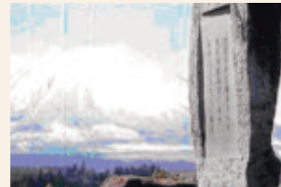
Takuboku monument at Shibutami Park