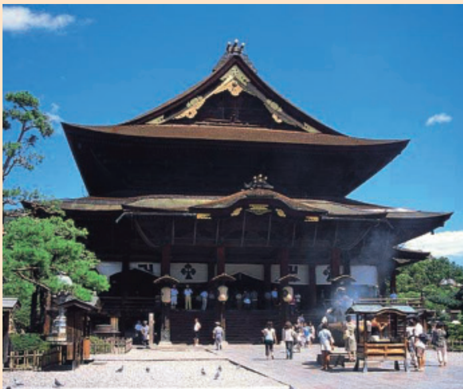
Zenko-ji Temple in Nagano City