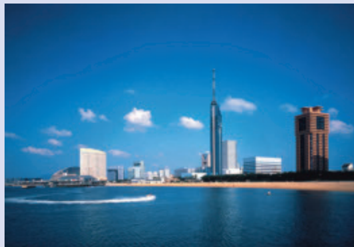
Fukuoka City seen from Momochihama