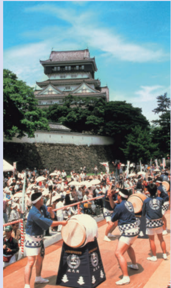
Kokura Gion Daiko Festival

The Gion festival started originally to worship the Hindu deity, with prayers to expel epidemics. Gion is the Chinese name of the Indian Jetavana Buddhist Monastery, which was built on the outskirts of Sravasti, the capital of ancient Kosala state, which is Saheth in U.P. State now. The Guardian Deity of Jetavana monastery is Gosheersh, who has the sacred power to expel epidemics. The legend of Gosheersh was introduced together with Buddhism into Japan. When epidemics raged throughout entire Kyoto , people prayed to Gosheersh, the Guardian Deity of Gion , for countering epidemics, by marching with 66 tall spears. This Gion Festival was introduced to Kokura City in 1617 by Tadaoki Hosokawa, the first lord of Kokura Castle, to wish for the good health and prosperity of his people. Since Taiko drumming was said to be included later on, it came to be known as Kokura Gion Daiko Festival. The festival was designated by Fukuoka Prefecture as Intangible Cultural Property in 1958 and is considered one of the three big Gion festivals in Fukuoka along with the Hakata and Tobata festivals.