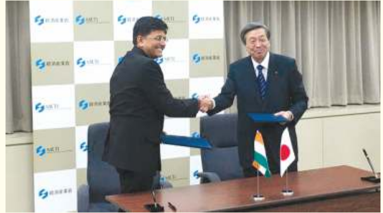
Minister Hayashi (right) with Minister Piyush Goyal