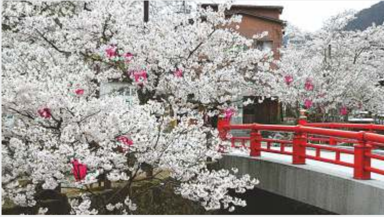
Kinosaki Hot Spring [Hyogo Prefecture]

To see more pictures or find information about travelling in Japan, visit the Japan National Tourism Organization (JNTO) website http://www.jnto.go.jp/ .