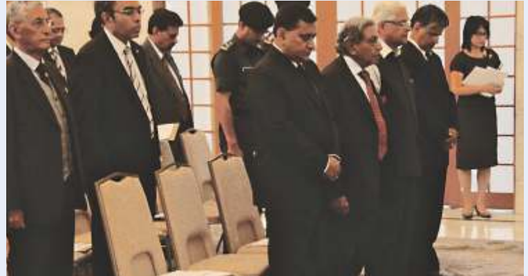
Silent prayer for the victims of the disaster