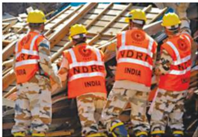
Members of NDRF team from India undertaking relief operations in Japan, following the Great East Japan Earthquake of March 11, 2011