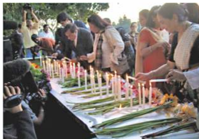
Indian people lighting candles in front of the Embassy of Japan, New Delhi, to pay condolences to the victims of the Great East Japan Earthquake of March 11, 2011