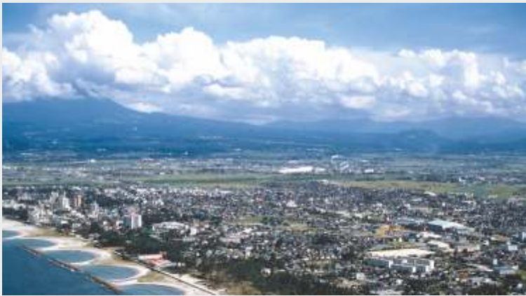
Kaike Hot Springs [Tottori Prefecture]