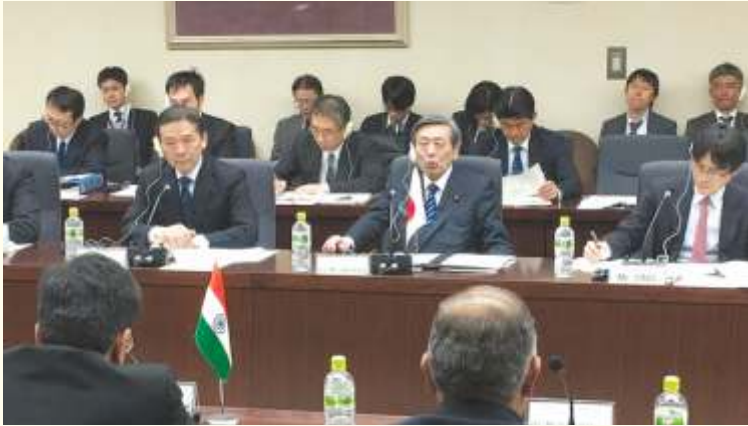
The Eighth Japan-India Energy Dialogue in Tokyo

[For more information: http://www.meti.go.jp/english/press/2016/0112_02.html ]