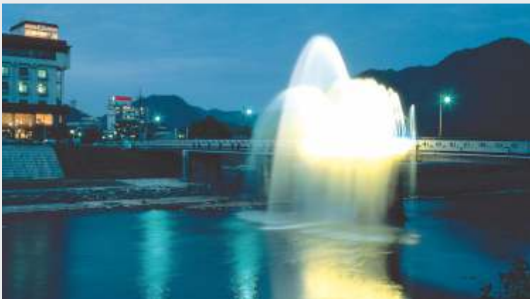
Yunogo Onsen [Okayama Prefecture]