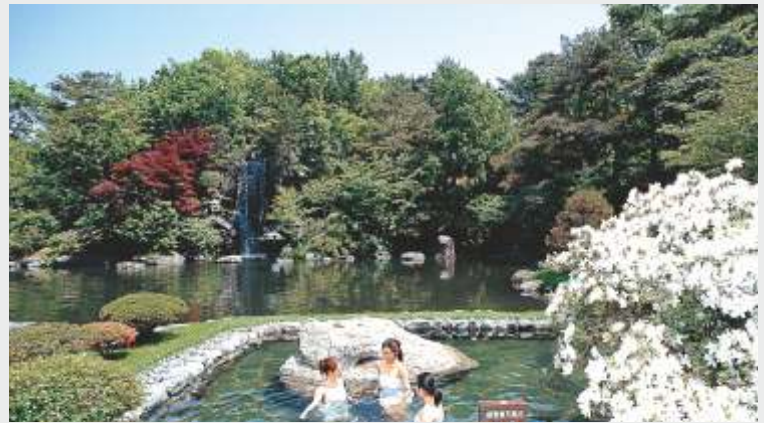
Komaki Hot Springs [Aomori Prefecture]