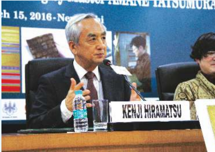
Opening remarks by Ambassador