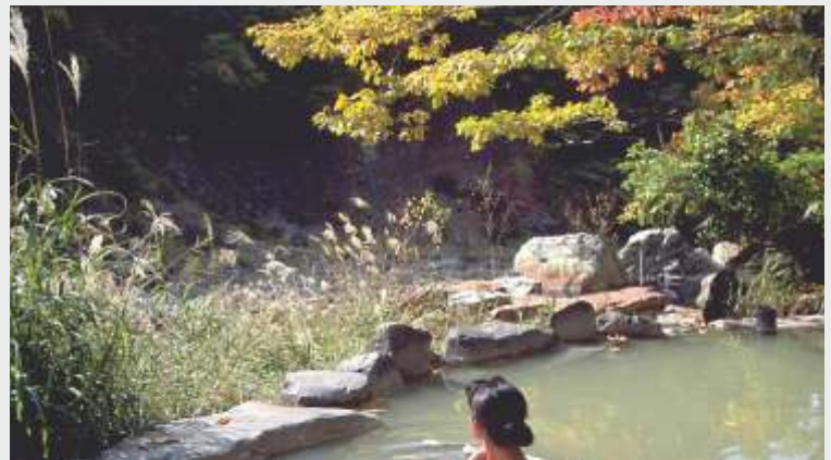
Goshiki Hot Springs [Nagano Prefecture]