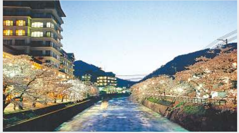
Atsumi Hot Springs [Yamagata Prefecture]