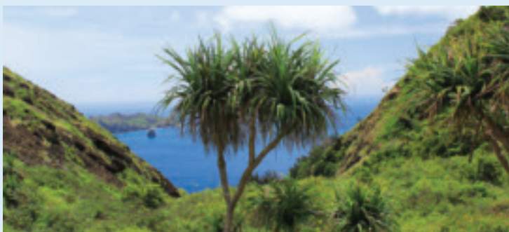
Ogasawara Islands [Tokyo Prefecture]