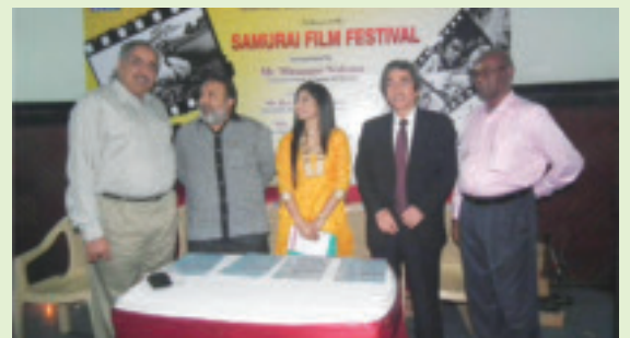
Samurai Film Festival at Chennai, organized by the Consulate General of Japan in Chennai, supported by the Indo Cine Appreciation Foundation and Japan Foundation, New Delhi