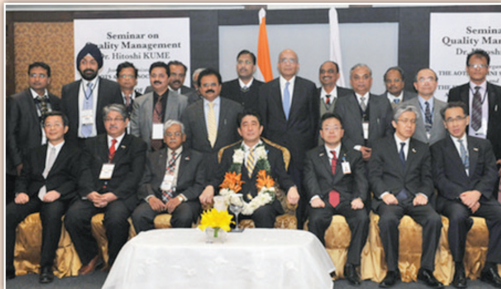
Prime Minister at the commemorative photograph session at the Overseas Human Resources and Industry Development Association (HIDA) and Association for Overseas Technical Scholarship (AOTS) Seminar on Quality Management