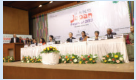
Japan Festival 2013 held at AMA Complex, ATRIA Campus, Ahmedabad, on 21-22 December 2013