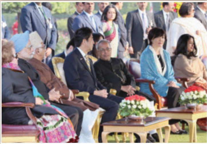
Prime Minister attending the reception hosted by the President of India