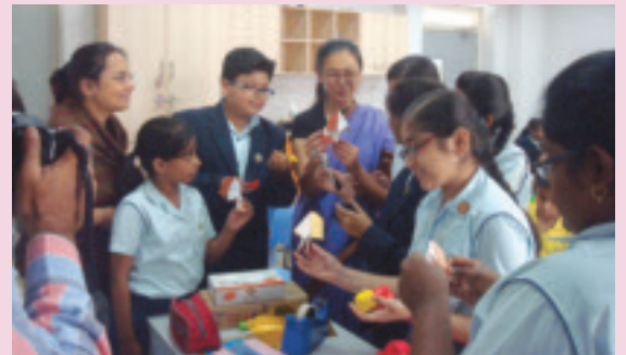
An Origami workshop on 14th February 2014