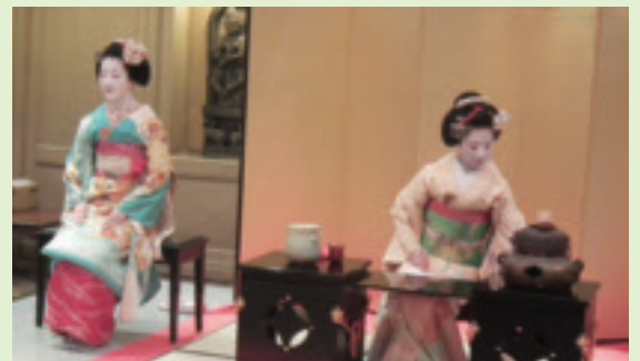
Maiko Lecture and Demonstration at the Taj Coromandel Hotel, Chennai