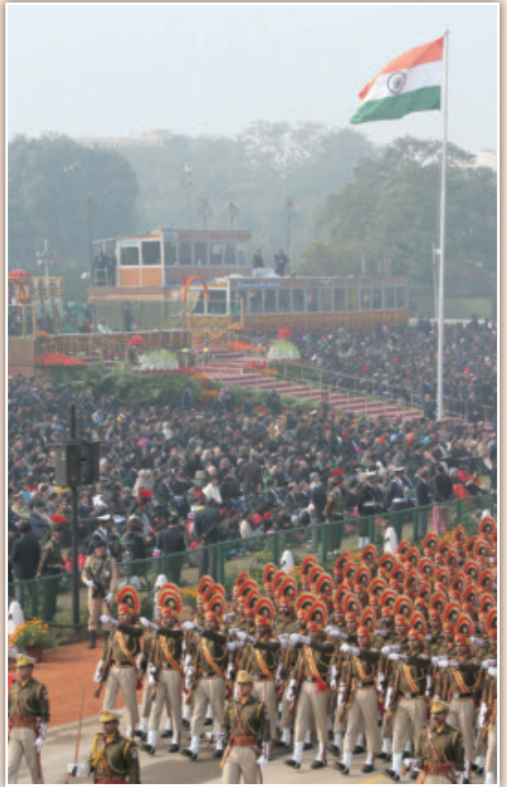
Republic Day Parade