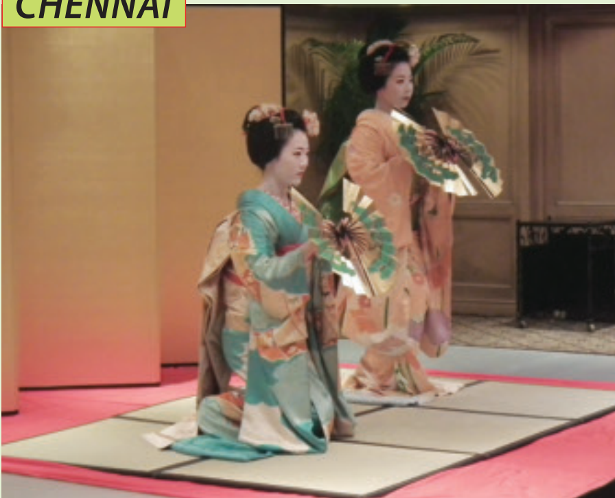
Lecture and Demonstration by Japanese Maiko, organized by the Consulate General of Japan in Chennai and Japan Foundation, New Delhi. Two Maiko from Gion, Kyoto, are dancing at the Taj Coromandel Hotel, Chennai, on 24th February 2014