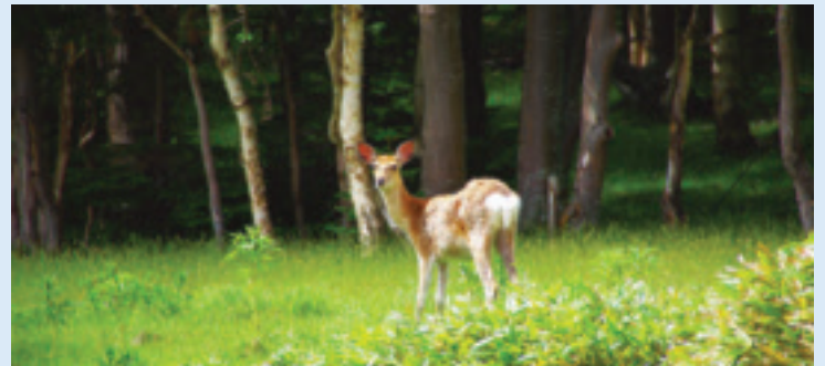
Shiretoko Peninsula [Hokkaido Prefecture]