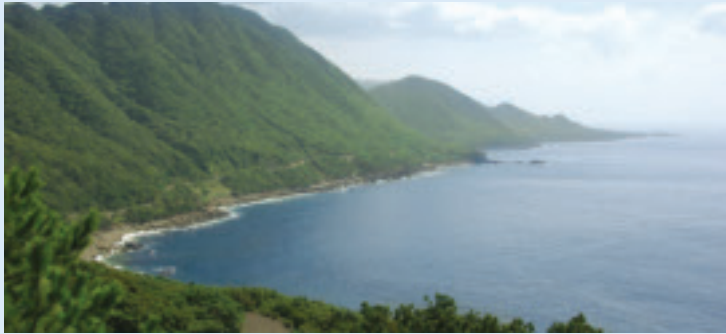
Yakushima Island [Kagoshima Prefecture]

To see more pictures or find information about travelling in Japan, visit the Japan National Tourism Organization (JNTO) website http://www.jnto.go.jp/