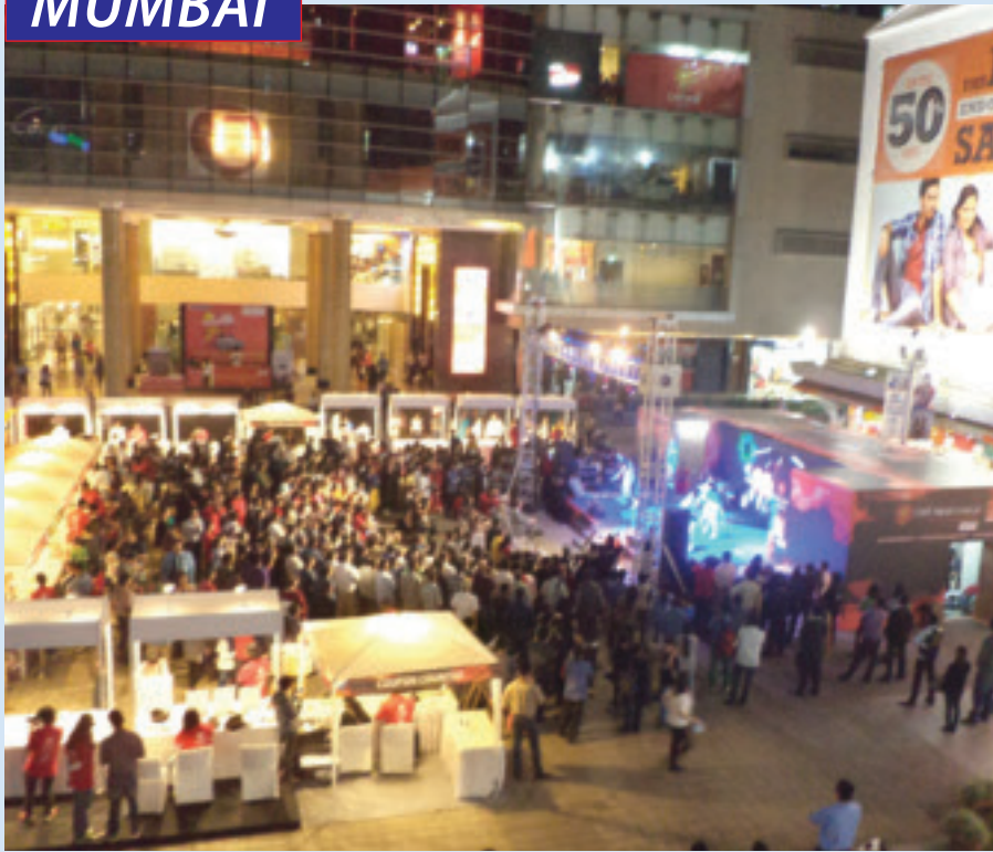
Cool Japan Festival 2014 held at The Courtyard of High Street Phoenix, Lower Parel, Mumbai, on 17-19 January 2014