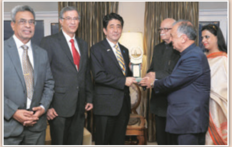
Prime Minister meeting with those involved with the Priyadarshni Academy