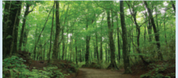
Shirakami Mountains [Aomori Prefecture]