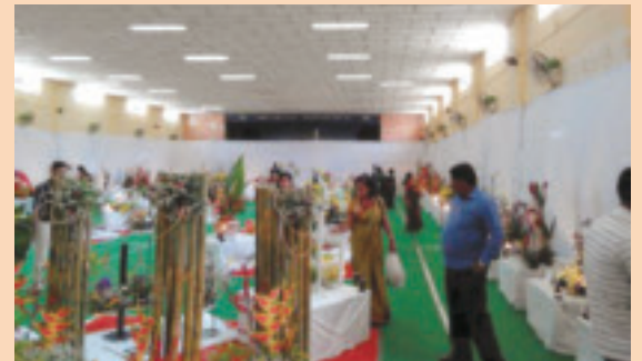
Ikebana flower arrangement held by Sogetsu Bangalore chapter on 22 February 2014