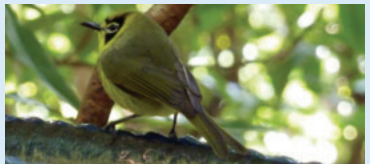
Bonin white eye [Tokyo Prefecture]