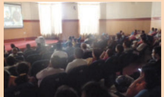
Screening a Japanese movie at Language Fair on 26 January 2014