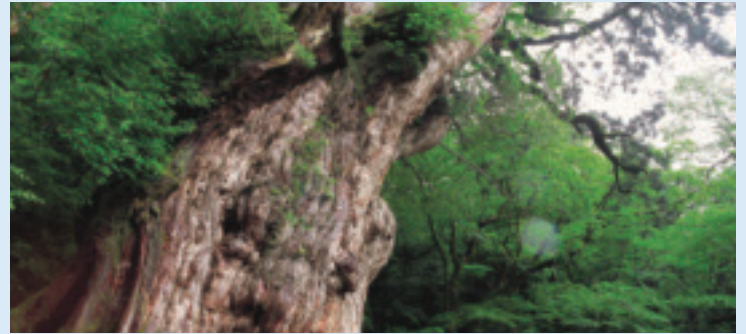
Yakushima Cedar [Kagoshima Prefecture]