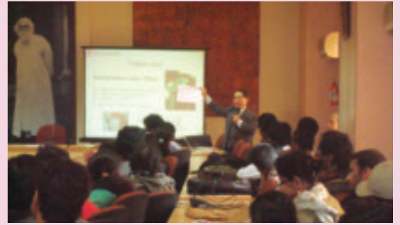
Education in Japan - Counselling session at Visva Bharati University, Santiniketan, on 24th January 2014