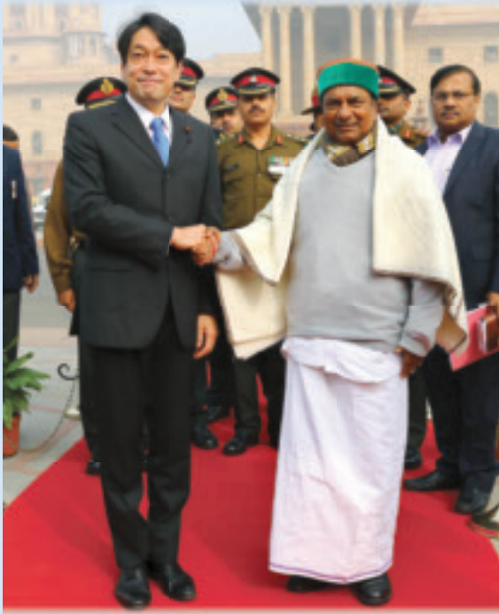
Defense Minister Onodera shakes hands with Defence Minister Antony

M r. Itsunori Onodera, Defense Minister of Japan, visited India from 5-8 January 2014 and held a meeting with Mr. A.K. Antony, Defence Minister of India. The two