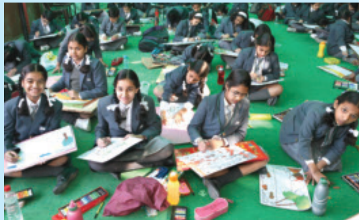
Environment Awareness Programme for school children, organized by JAAI on 7 February 2014

If you are interested in more information on JAAI, please contact JICA India Office (Tel: 011-4768-5500).