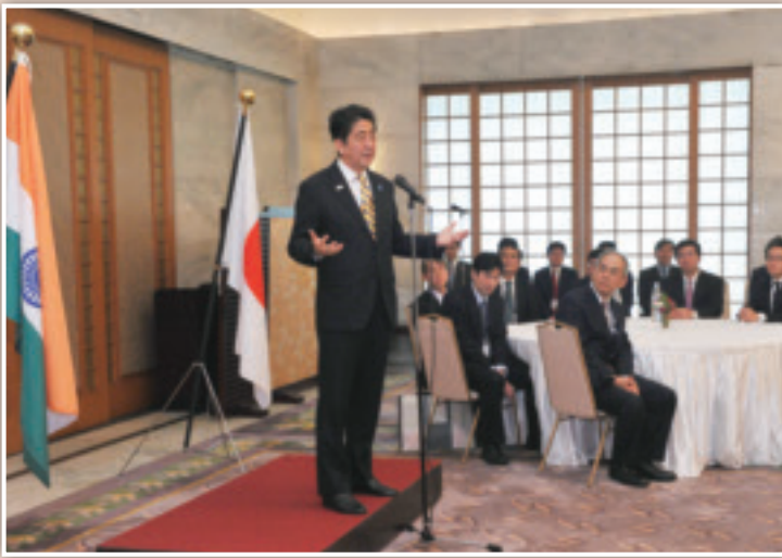
Prime Minister delivering an address at the meeting with the accompanying representatives of the Japanese business community