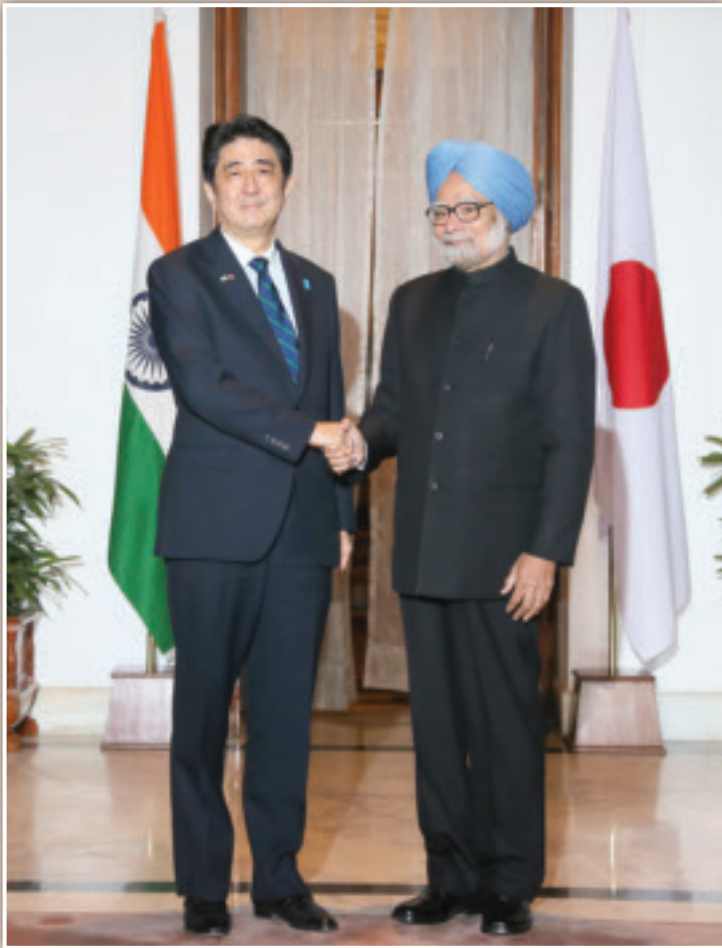
Prime Minister Abe shaking hands with H.E. Dr. Manmohan Singh, Prime Minister of India

H.E. Mr. Shinzo Abe, Prime Minister of Japan, visited India from 25-27 January 2014, during which he attended the Republic Day Parade in New Delhi on 26 January as the Chief Guest. He also held extensive talks on bilateral, regional and global issues with H.E. Dr. Manmohan Singh, Prime Minister of India.