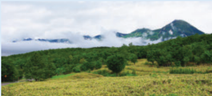
Shiretoko Peninsula [Hokkaido Prefecture]