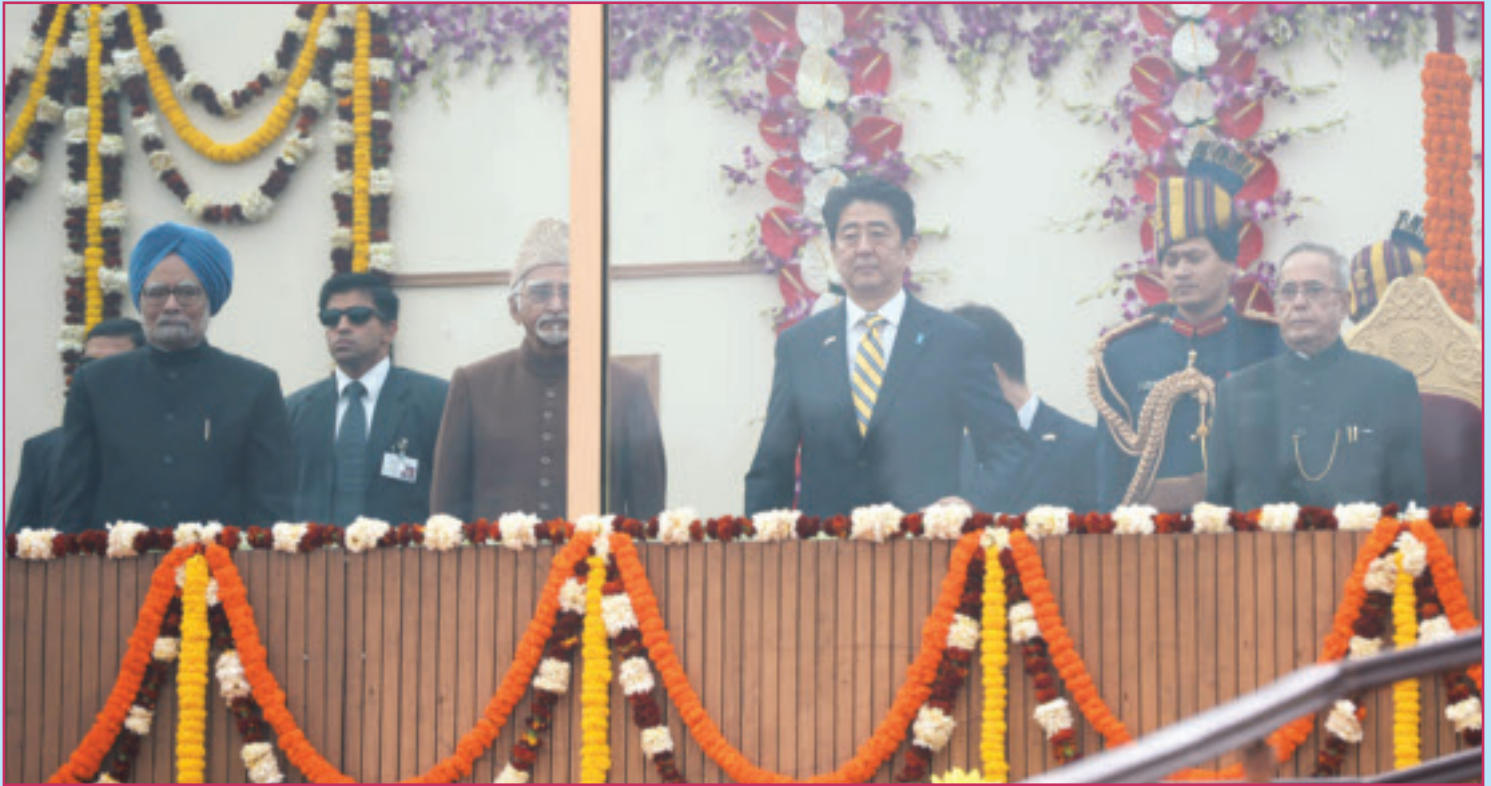
H.E. Mr. Shinzo Abe, Prime Minister of Japan, reviewing the Republic Day Parade on 26 January 2014, in New Delhi

🇯🇵 A quarterly newsletter from the Embassy of Japan, India 🇮🇳