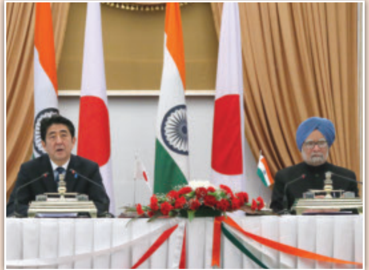
Japan-India joint press announcement

H.E. Mr. Shinzo Abe, Prime Minister of Japan, visited India from 25-27 January 2014, during which he attended the Republic Day Parade in New Delhi on 26 January as the Chief Guest. He also held extensive talks on bilateral, regional and global issues with H.E. Dr. Manmohan Singh, Prime Minister of India.