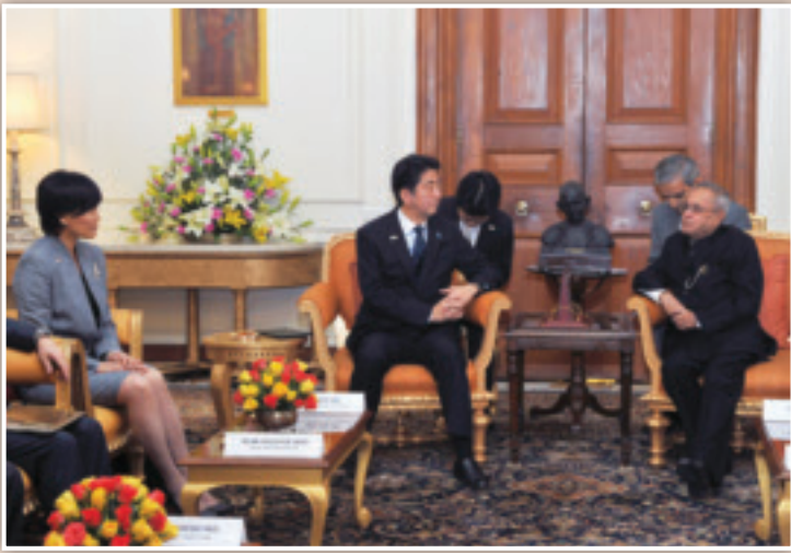
Prime Minister Abe paying a courtesy call on H.E. Mr. Pranab Mukherjee, President of India