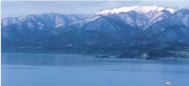
Shirakami Mountains [Aomori Prefecture]