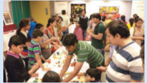
Japan Festival 2013 held at AMA Complex, ATRIA Campus, Ahmedabad, on 21-22 December 2013