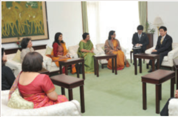
Prime Minister conversing with women leaders