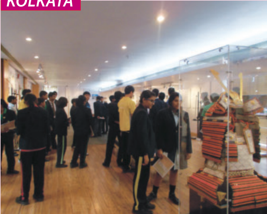
“Spirit of Budo”, an exhibition on the history of martial arts of Japan, held at ICCR Kolkata in January 2014, organised by the Consulate-General of Japan in Kolkata, supported by the Japan Foundation