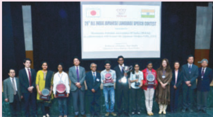
Contest winners pose for a group photograph

The eligible 8 prize winners in the senior and junior categories of the final round of the 2014 All India Japanese Language Speech Contest will be invited to visit Japan under the JENESYS 2.0 Short-term Invitation Programme in Japan, in June 2014.