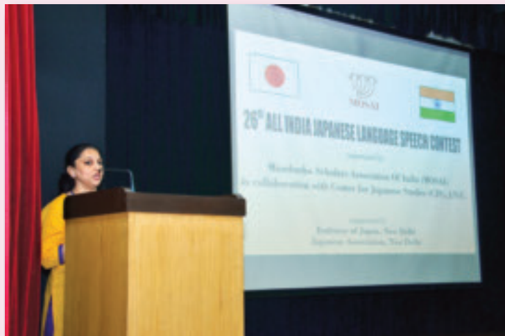
One of the participants in the senior category