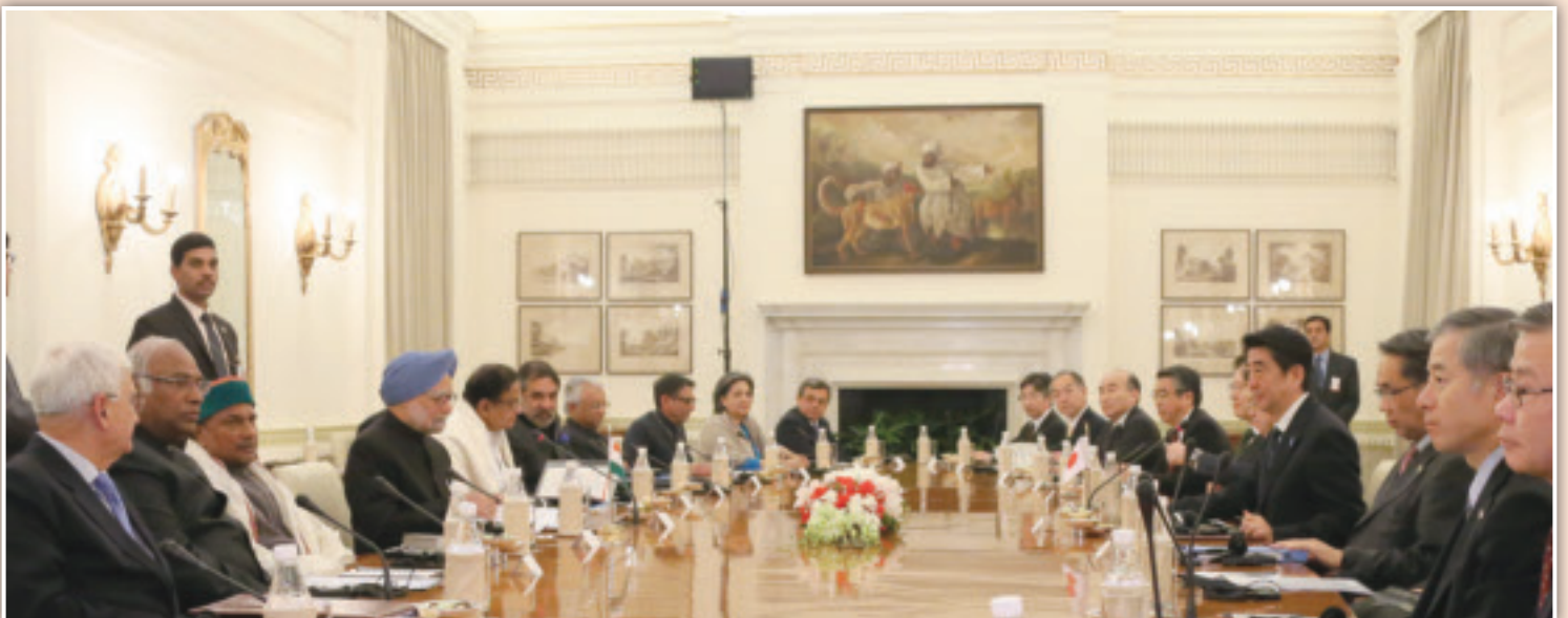
Japan-India Summit Meeting