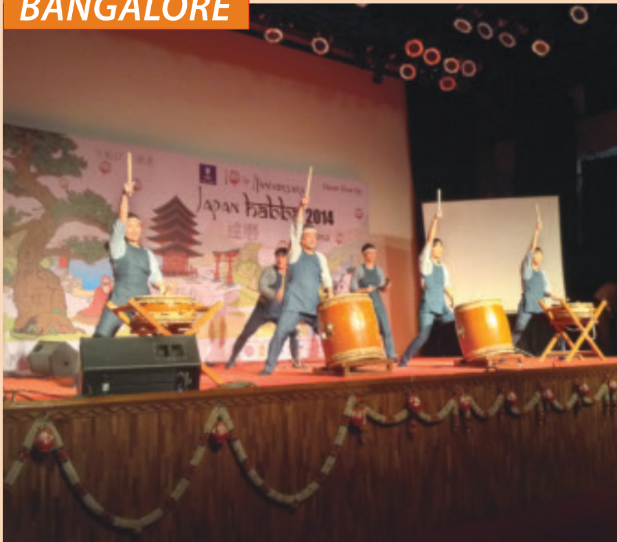
The performance of Wadaiko, Japanese traditional drums, at the Japan Festival on 23 February 2014