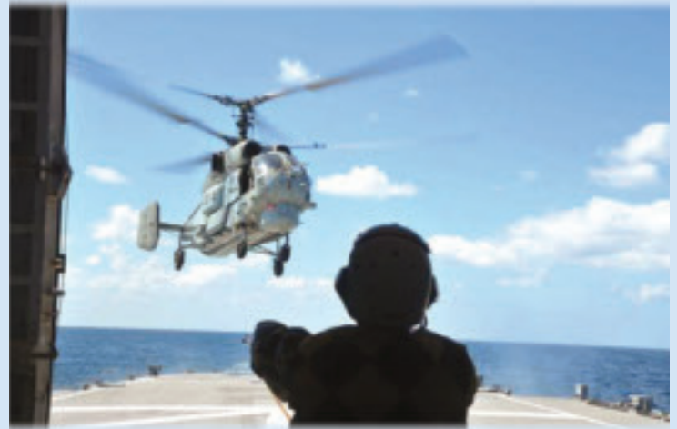
Indian Helicopter landing at Japanese vessel, Japan-India Maritime Exercise

Ministers exchanged ideas regarding regional and global security challenges, as well as bilateral defense cooperation and exchanges between Japan and India. They also shared views on issues relating to the peace, stability and prosperity of the region.