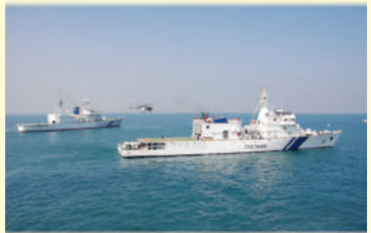
Joint Exercise between Japan Coast Guard and Indian Coast Guard