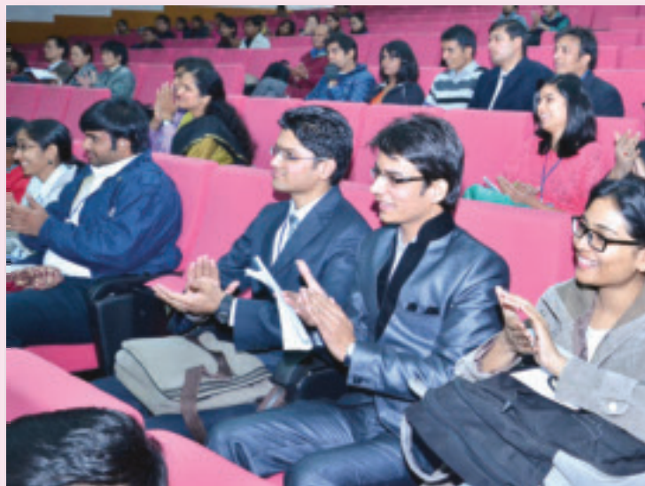
Audience and participants cheering the contestants