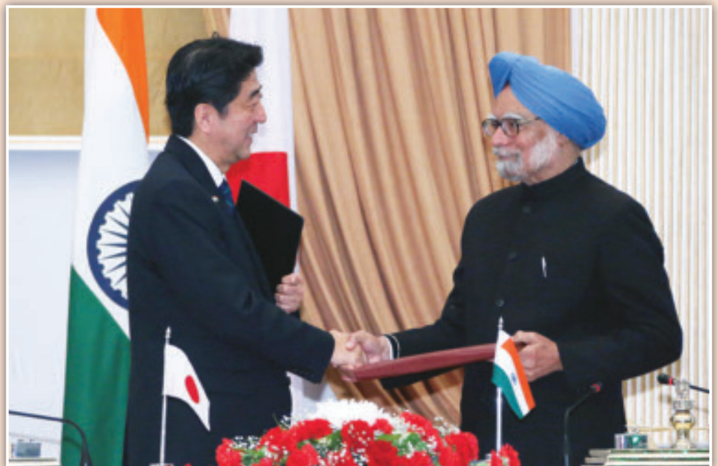
Signing Ceremony for the Japan-India Joint Statement

For details, please visit: http://www.mofa.go.jp/s_sa/sw/in/page3e_000139.html and http://japan.kantei.go.jp/96_abe/actions/201401/25india_e.html