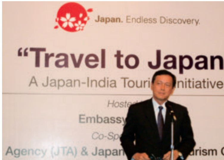
Ambassador Saiki addresses the Japan Tourism Promotion event (14 July, 2011)

The Seminar covered wide-ranging issues beyond tourism. The panelists highly praised the sense of responsibility and solidarity of the Japanese people in the tsunami devastated area. They also stressed that enhancing a win-win economic relationship is crucial for the economic recovery and reconstruction of Japan, and concluded that increasing trade and investment through CEPA (Comprehensive Economic Partnership Agreement), which will take effect on 1 st August, is important. Besides, they agreed that expanding business ties between the two countries through steadily implementing flagship projects including DFC (Dedicated Freight Corridor) and DMIC (Delhi-Mumbai Industrial Corridor) is extremely valuable.