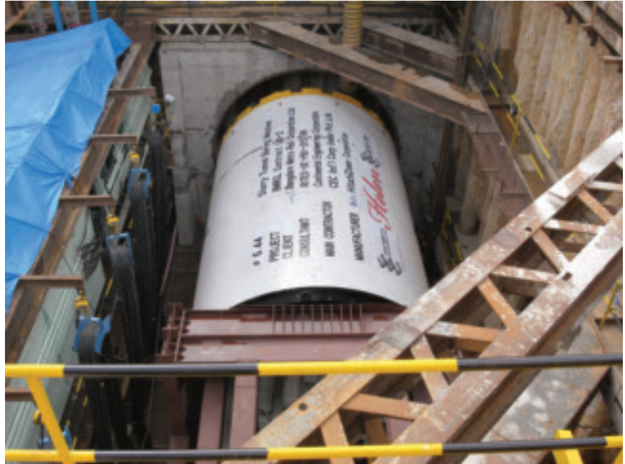
A view of the Majestic Metro underground site in Bangalore, after the inauguration of the tunneling work on 20 May 2011

The official inauguration of the tunneling work on the Namma Metro project took place on 20 May 2011, with H.E. Mr. B.S. Yeddyurappa, Honourable Chief Minister of Karnataka, switching on the machine in a ceremony in Bangalore, in