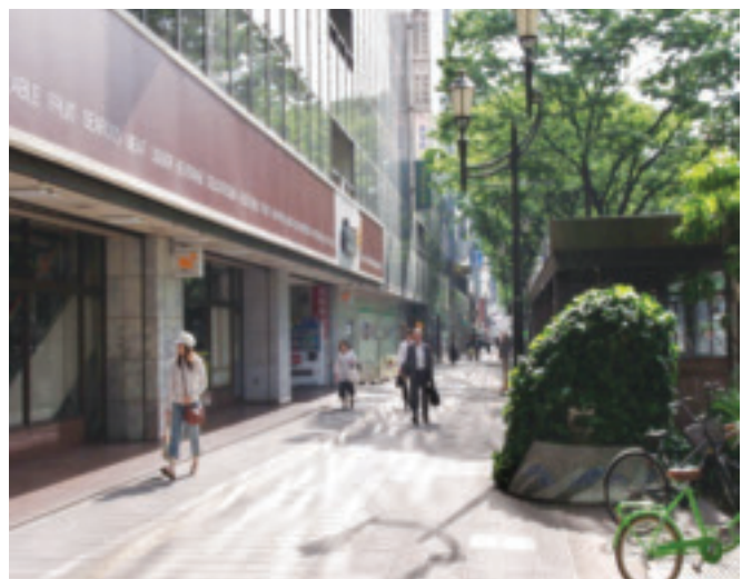
These are some current photographs of Sendai, which is now almost fully back to normal, after being one of the hardest hit areas to suffer the devastation of the massive earthquake and tsunami of March 11, 2011.