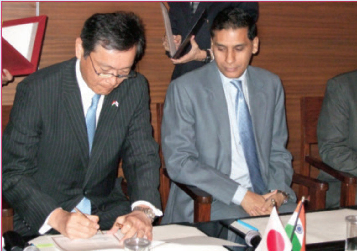
Japan extends Soft Loan Package to India under the Second Batch of FY 2010 (6 June 2011)

☐ A quarterly newsletter from the Embassy of Japan, India 🇮🇳