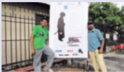
Two fans who travelled 1000 kms. for the first Festival

In Japan, people of all ages read manga. The medium includes works in a broad range of genres, such as, action-adventure, romance, sports and