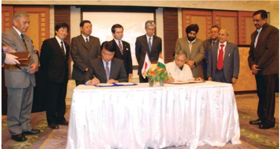
Hon'ble Mrs. Sheila Dikshit, Chief Minister of NCT of Delhi (seated right), and Mr. Hiroshi Ogawa, Governor of Fukuoka Prefecture (seated left), signing the MOU in the presence of Mr. Takeshi Yagi, Ambassador of Japan to India (centre)

From 21 st to 24 th November 2012, a delegation of the Governor of Fukuoka Prefecture, Japan, visited New Delhi. During this visit, the signing ceremony of MOU of friendship between Fukuoka Prefecture and NCT of Delhi, which was signed in 2007, was held to extend another 5 years of cooperation. In addition, a Fukuoka Business Promotion and Fukuoka University Fair was held in New Delhi during the visit.