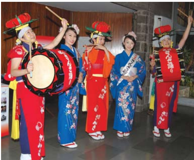
Traditional dancers from Tohoku region presenting a musical performance at the event

Japan has made tourism as one their key priorities in uplifting the country's economy out of the calamities of 2011. JNTO is actively promoting the destination in the Indian market as part of its emerging markets strategy to inspire leisure travellers to visit Japan. In first eight months of 2012, the number of total Indian visitor arrivals stood at 45,200, which is an impressive 18.4% growth compared to the same period in the year 2011. Apart from traditional marketing strategies, Japan is also leveraging on the social media platforms like a dedicated "Visit Japan from India" Facebook page, targeted specifically for its Indian fans.