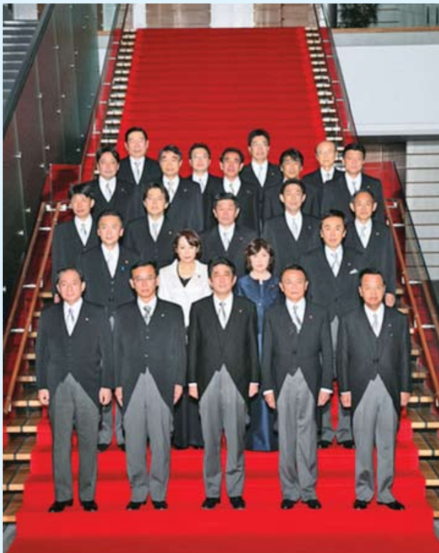
Members of the Abe Cabinet

In this endeavor, I would like to ask for the understanding and cooperation of the Japanese people.