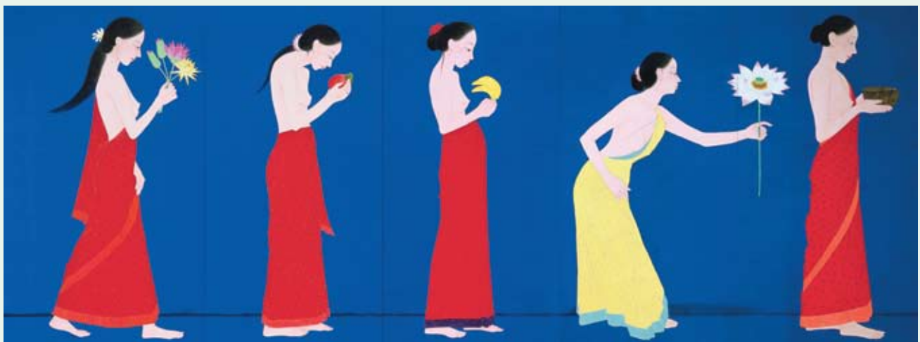
One of the works by the artist on display at the exhibition