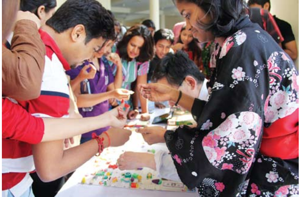
On the occasion, a 'Lucky Dip' game was also held during the intermission, in which Japanese promotional gift items were distributed among the JNU students attending the film festival.

A Japanese Film Festival, co-organized by the Embassy of Japan, Japan Foundation, and Jawaharlal Nehru University, was held on the 21st and 28th of September 2012, at Auditorium-I, Convention Centre, JNU, New Delhi.