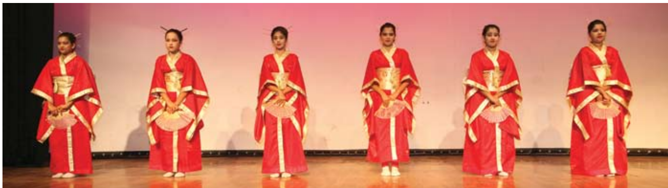
A beautiful cultural programme was put up by the students of DPS Dwarka

D elhi Public School – Dwarka, under the aegis of DPS Society, organized Nihon No Kaori 2012 – Annual Inter School Japanese Language Festival on Wednesday, 17 October 2012. Twenty five renowned schools from Delhi NCR and U.P. participated in this event.