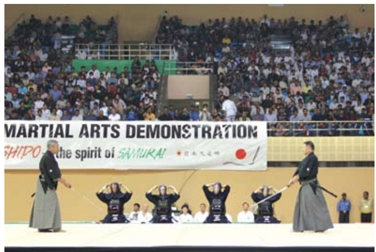
Enshin-ryu Iai Suemonogiri Kenpo demonstration

Youth Affairs and Sports, and Ministry of External Affairs, Government of India, and FICCI. Besides the above, the delegation conducted special demonstrations at Delhi Police's Special Protection Unit for Women and Children, and the Japanese School in New Delhi. The visiting Karate experts, Judo experts and Aikido experts also conducted special workshops for dojos in Delhi.