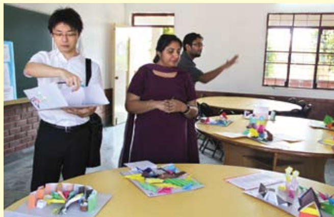
Judges evaluating the competition entries

T he 10 th annual Inter-School Origami Competition was organized on Thursday, 11 October 2012, by Tagore International School, Vasant Vihar, New Delhi, in cooperation with the Embassy of Japan. 313 students across Grade III to XII from 35 schools participated in the competition this year, in categories of ‘solo’, ‘group’, and ‘teachers’ with different themes, and displayed their skills in paper-folding art innovatively.