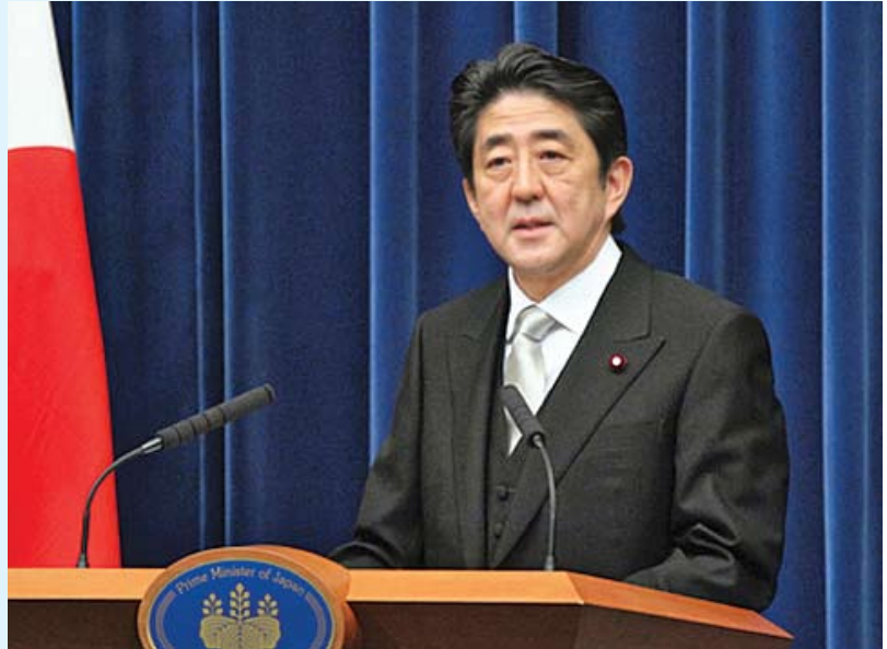
Prime Minister Shinzo Abe speaking at the press conference

In the evening, new Prime Minister Shinzo Abe held a press conference, which was followed by the first Cabinet meeting and the taking of commemorative photographs.