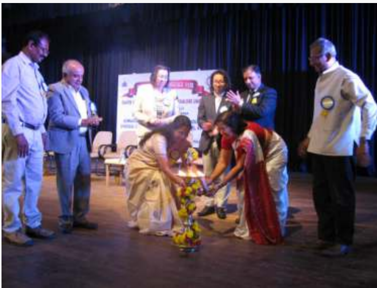
“International Language Fair”