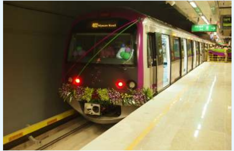
The Bengaluru Metro, being opened to traffic