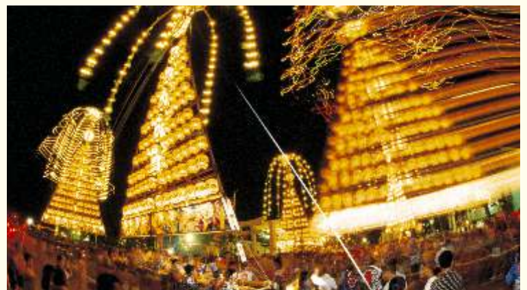
Tatemon Festival [Toyama Prefecture]