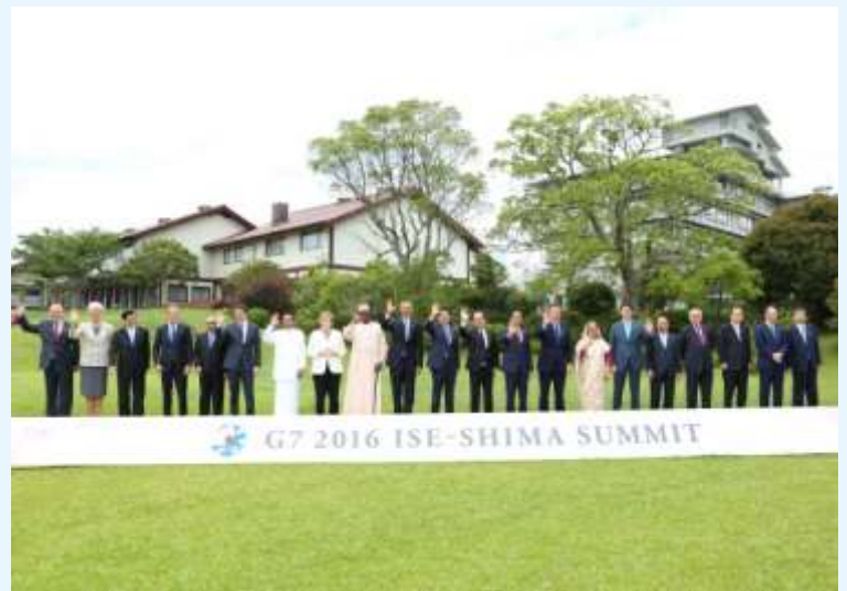
Family photo with G7 and Outreach Partners