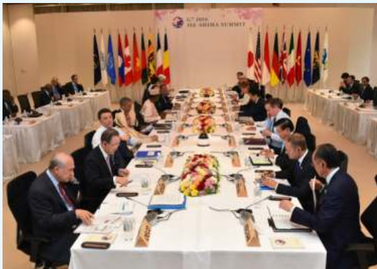
Outreach Session 1