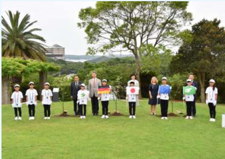
Tree Planting Ceremony (Shima Kanko Hotel)