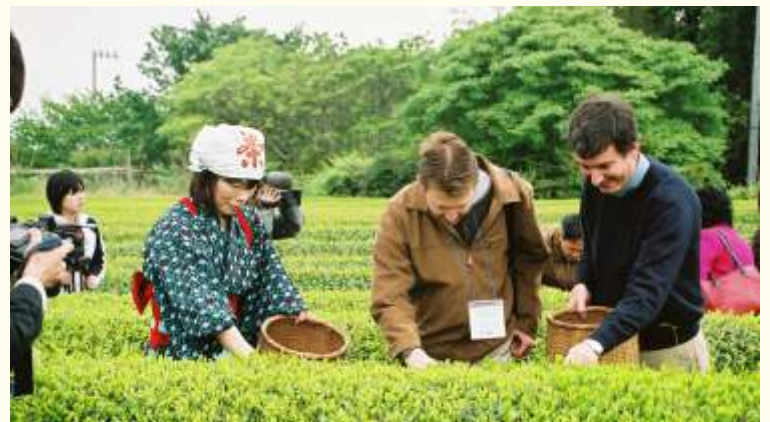
Tea Picking Experience [Shizuoka Prefecture]