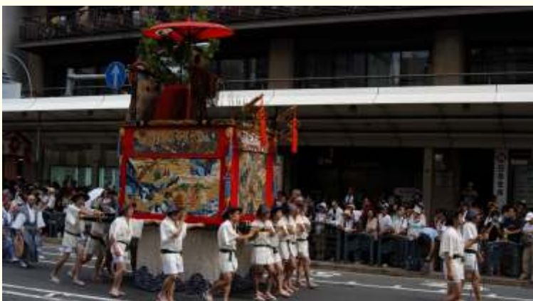
Gion Festival [Kyoto Prefecture]