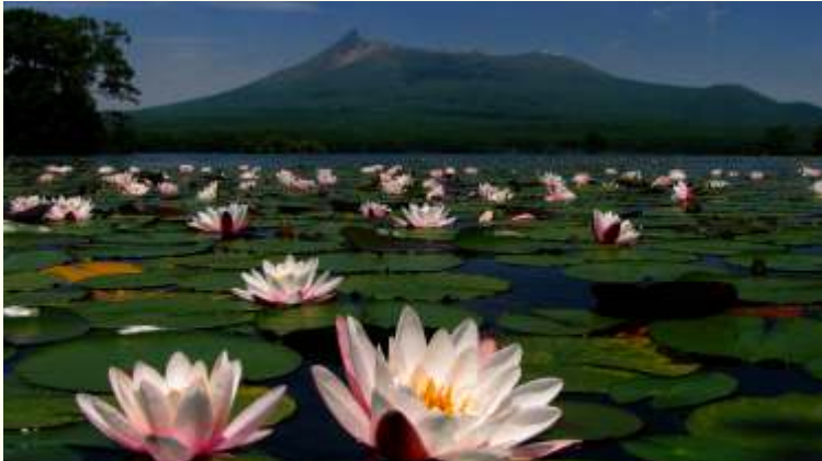
Onuma Quasi-National Park [Hokkaido Prefecture]

To see more pictures or find information about travelling in Japan, visit the Japan National Tourism Organization (JNTO) website http://www.jnto.go.jp/