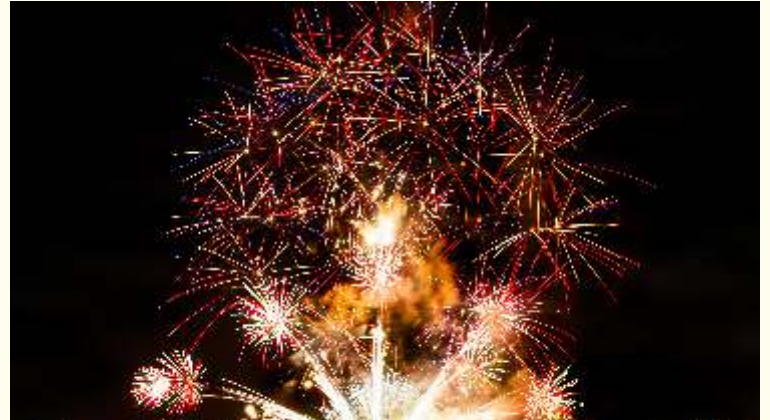
Hiroshima Yume-Minato Fireworks Display [Hiroshima Prefecture]