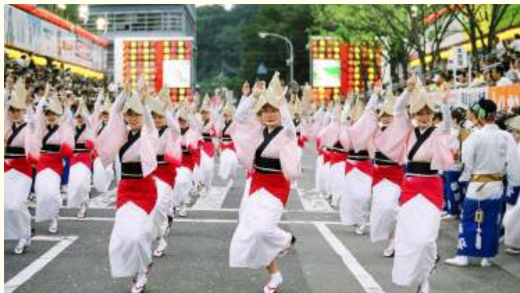
Awa Dance Festival [Tokushima Prefecture]