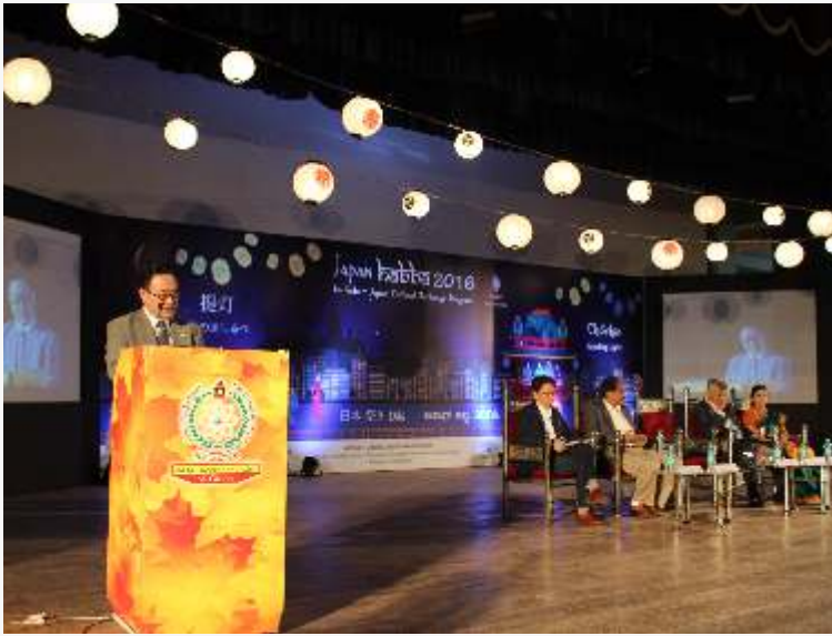
“Japan Habba 2016”