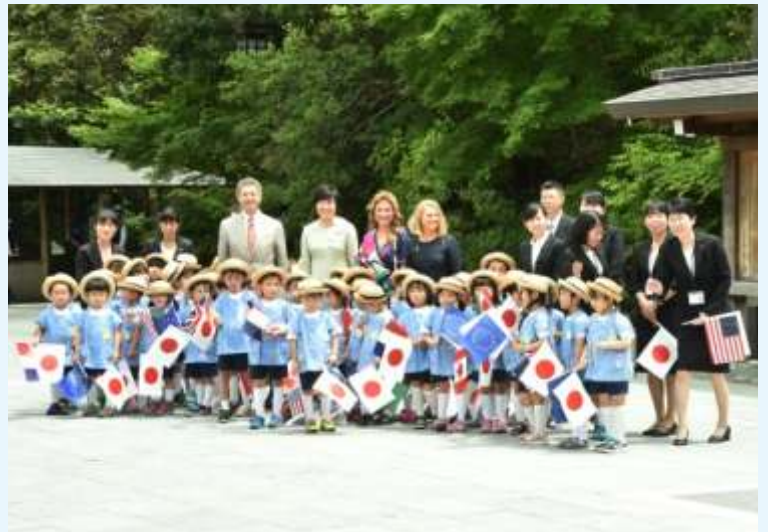
Visit to Ise Jingu