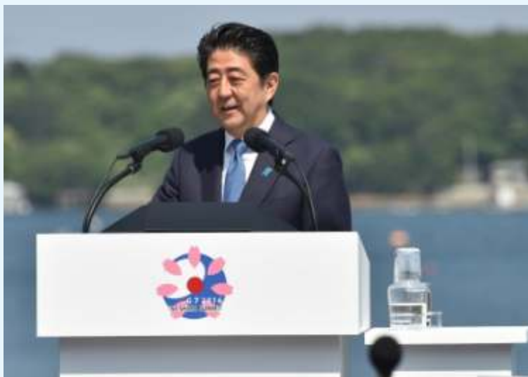
Presidency Press Conference