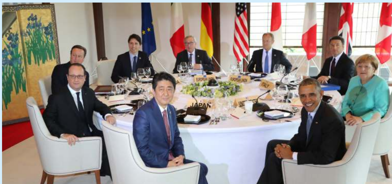
Summit Meeting of the leaders of the G7, in Ise-Shima, Mie Prefecture, Japan