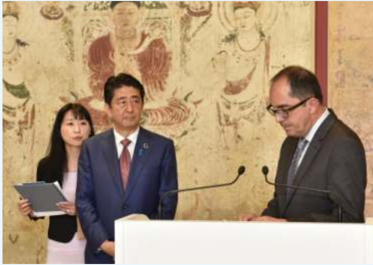
Terrorism and Cultural Property