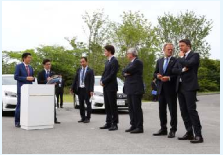
Automated-Driving and Fuel Cell Vehicle presentation