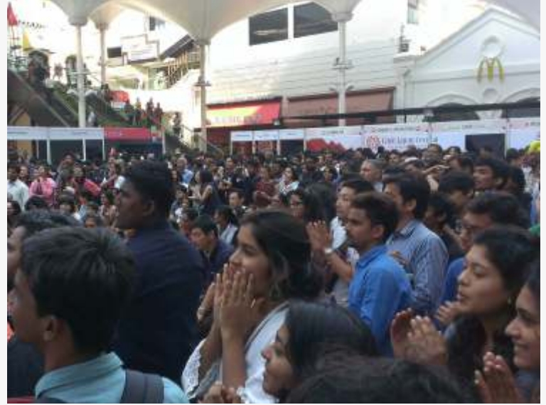
Audience enjoying performances at the 5th Cool Japan Festival, the biggest Japanese event in India, which was held on February 6-7, 2016, at the High Street Phoenix, Lower Parel in Mumbai. The festival with the theme 'Let's learn about Japan' showcased Japanese cultural performances, and visitors to the festival could purchase and try Japanese products while enjoying delicious Japanese food.