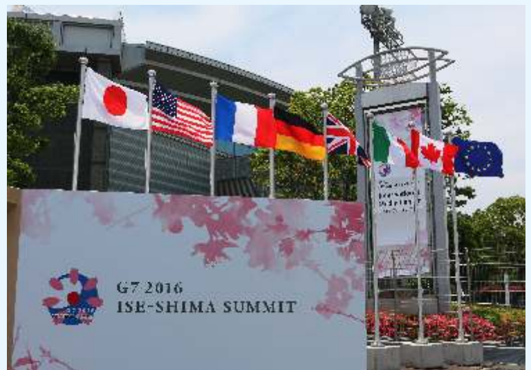
International Media Center