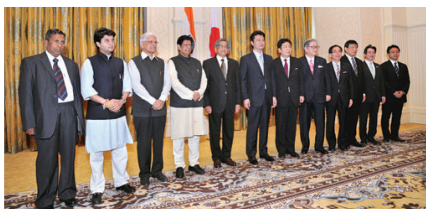
The First India-Japan Ministerial-Level Economic Dialogue