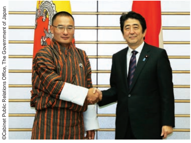
Prime Minister Tshering Tobgay and Prime Minister Shinzo Abe

The Embassy of Japan will conduct quiz and interactive sessions to stimulate interest and encourage students to learn more about Japanese arts, culture, society and Japan-Bhutan relations.