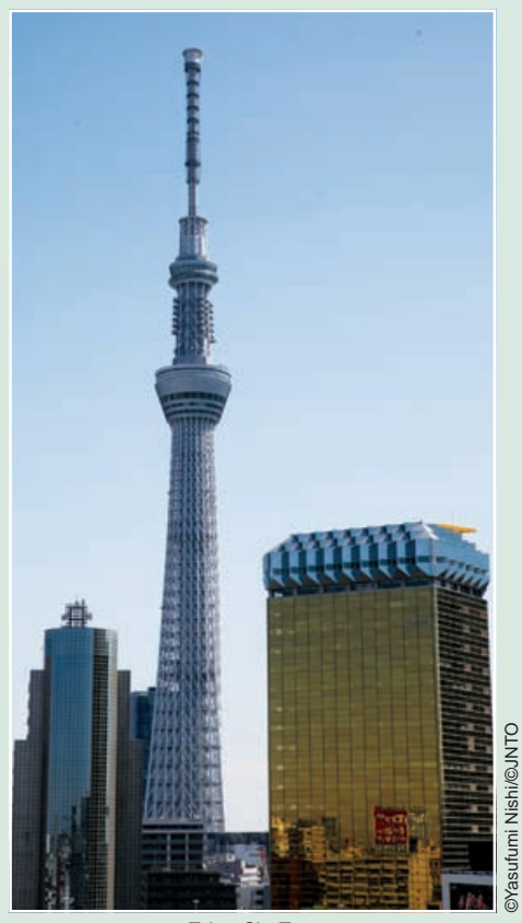
Tokyo Sky Tree