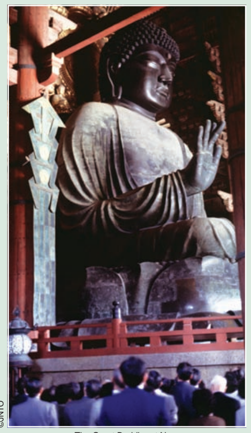
The Great Buddha at Nara